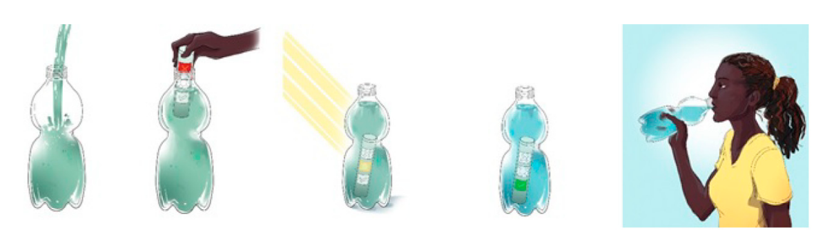
Figure 2. Scipio enhanced application of the SODIS method.