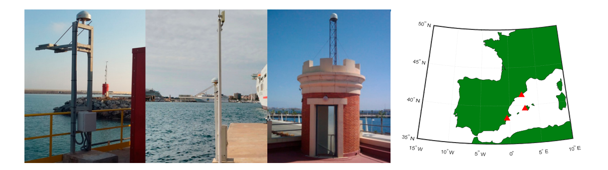
Figure 1. BCL1, MAL1 and ALAC GNSS antennas. General location map (right).

Once the better method has been identified, it is applied to the data of three stations belonging to the ERGNSS for a longer period of time (mid-2016 to end-2018). The stations analysed are BCL1, MAL1 and ALAC (Figure 1), all of them located in the Mediterranean coast (Figure 1, right). In all cases, the data sampling used was 30 s.