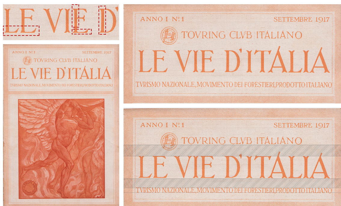
Figure 4. The first cover of Le Vie d'Italia , September 1917. Analysis.

The space of the cover (Figure 4), defined by a frame in coloured cross-hatching, is divided by a thinner pinstriped band into two parts—the upper part for the header and the lower one for the manifesto. The capline of the title, Le Vie d'Italia , in centred upper-case letters, is defined by the midline of the upper box. Situated above the title is Touring's logo followed by the wording Touring Club Italiano. The very long subtitle of the periodical, Turismo nazionale. Movimento dei Forestieri. Prodotto Italiano , is placed under the title and obviously lacks the necessary harmonic kerning.