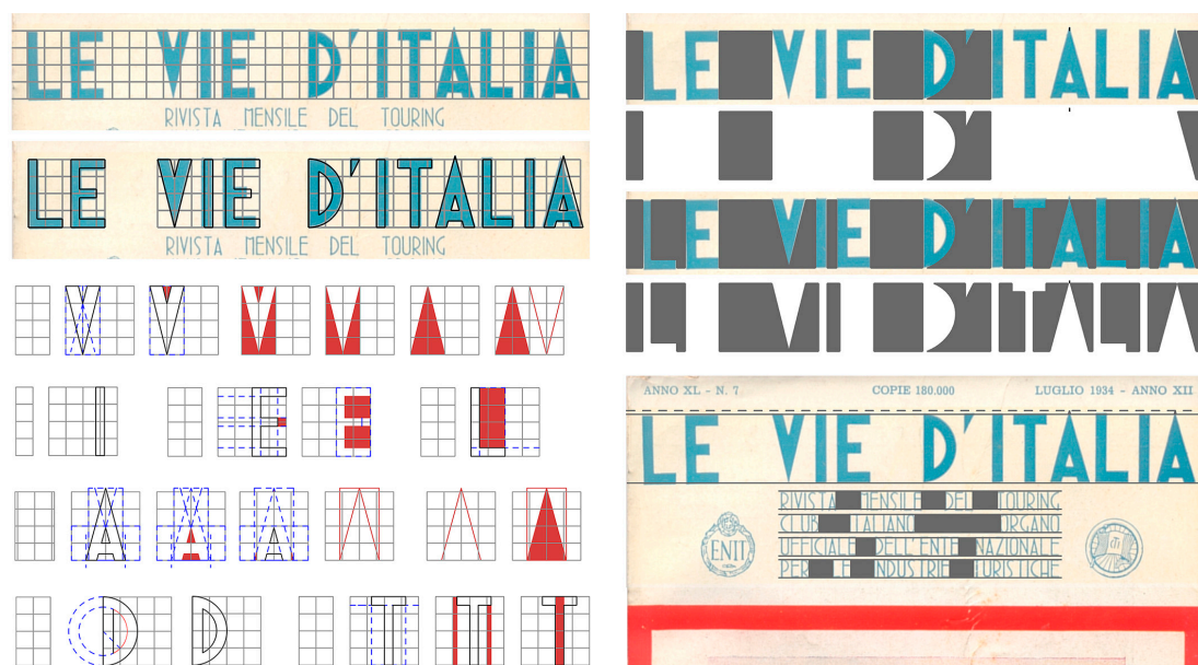
Figure 7. The new graphical look of the magazine renewed in 1933. The design of the characters, the kerning, the spacing between the words and the interline spacing.

very original invention of the cover/manifesto in line with the changing cultural climate, which was no longer open to experimentation and innovation (Figure 8).