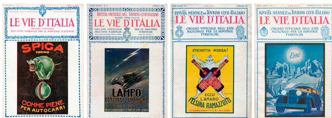
Figure 5. The search of recognizable graphics: the changes to the covers in April 1920, in April 1921, in April 1920, January 1927 and February 1930.

Another modification was made already in April 1921 (Figure 5): the floral motif of the upper frame is reinterpreted geometrically, framed at the corners by the fasces, and the crest moved down, while the lower frame continued to change throughout 1922, when a thin weave of curved line segments was settled upon.