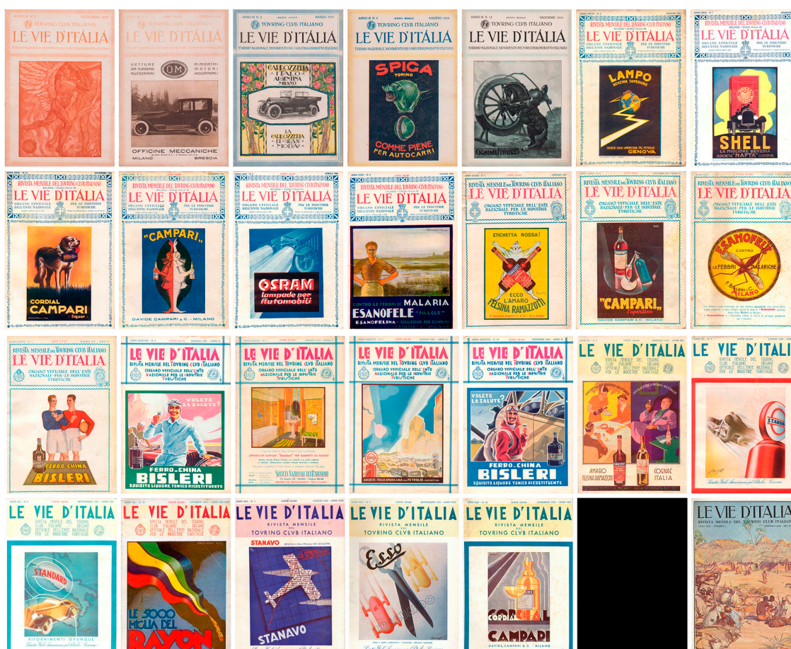
Figure 8. The “landscape of Italian products” that the covers progressively assemble up through January 1936 when the Mercato a Belet Uen sull'Uebi Scebeli by Giorgio Oprandi spelt the end of the very original invention.