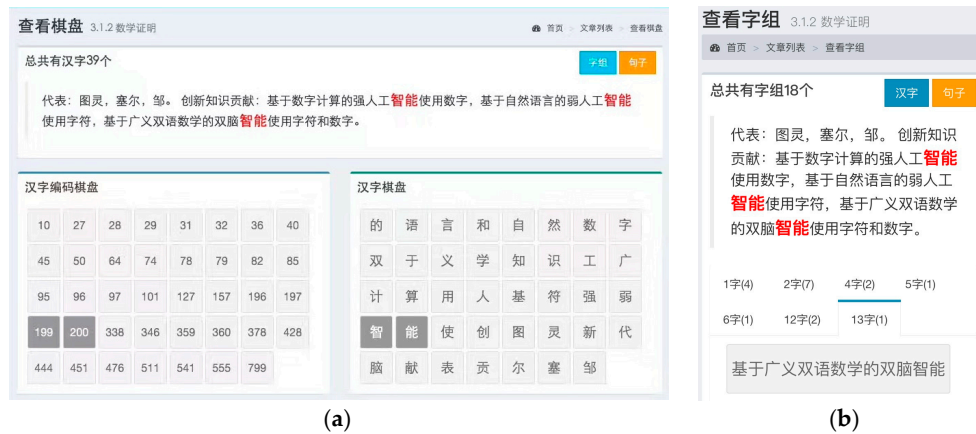
Figure 2. This is a formal twin chessboard and its application listed as: (a) Description of what is language chessboard; (b) Description of what is knowledge chess-menu and original chess-soul [11].