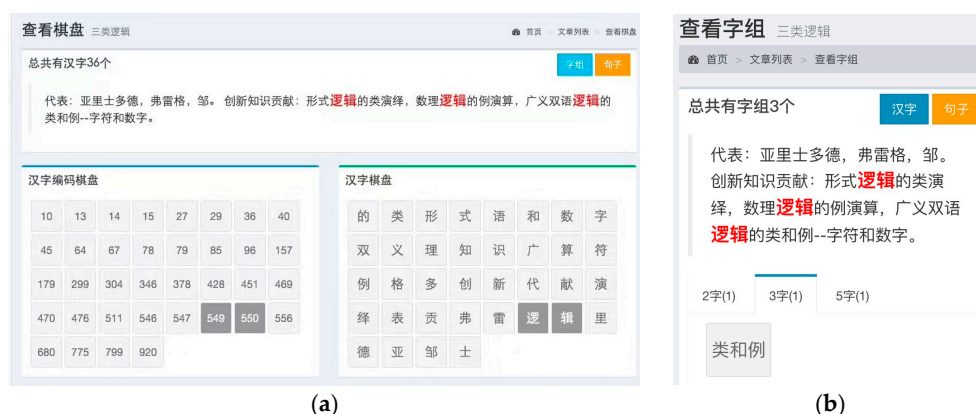
Figure 1. This is a formal twin chessboard and its application listed as: (a) Description of what is language chessboard; (b) Description of what is knowledge chess-menu and original chess-soul [11].

The Chinese version of the above paragraph, through Figure 1 and Table 1, you can verify our language chessboard and its application generated knowledge chess-menu and original chess-soul.