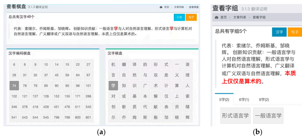
Figure 3. This is a formal twin chessboard and its application listed as: (a) Description of what is language chessboard; (b) Description of what is knowledge chess-menu and original chess-soul [11].

The Chinese version of the above paragraph, through Figure 3 and Table 3, you can verify our language chessboard and its application generated knowledge chess-menu and original chess-soul.