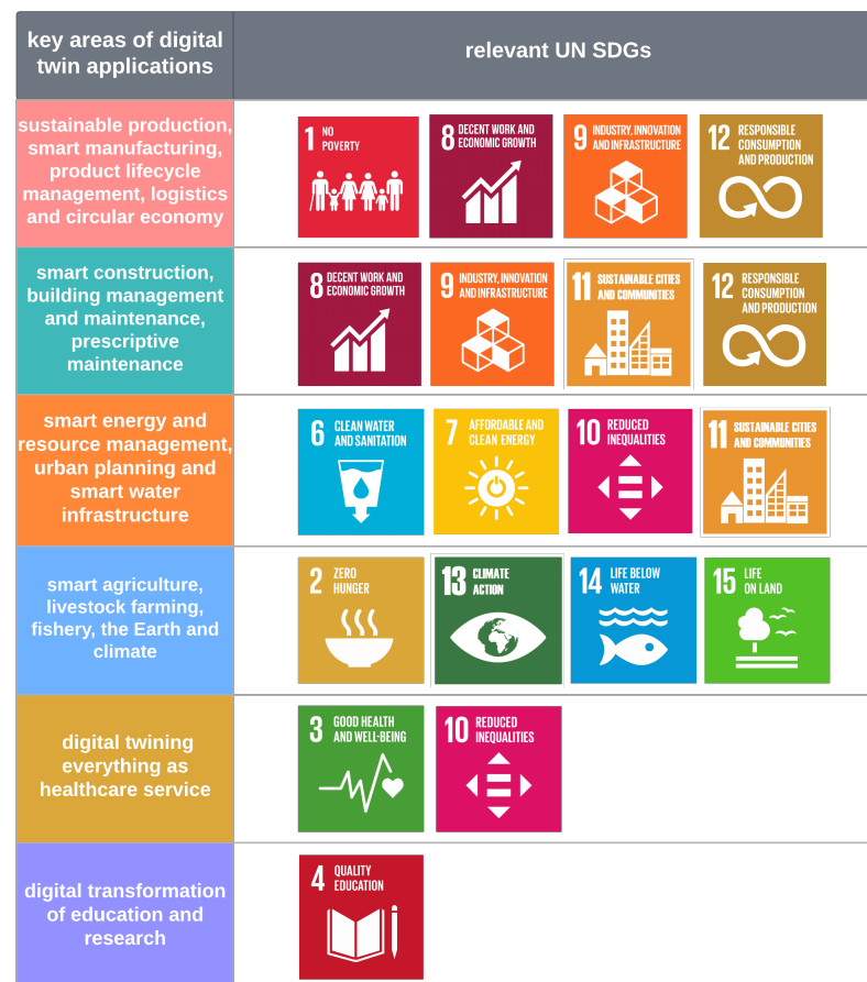
Figure 3. Digital twin implementations supporting UN SDGs.

Given the impact of digital twin implementations in manufacturing and its immeasurable contributions to the industrial revolution 4.0, the construction sector could perhaps realise its potential by embracing digital twin technology. Here digital twin could real show the benefits of the digital future, as construction, even general engineering and building management, are all significantly influencing the progress of several UN SDGs (as can be seen in Figure 3). There are a few recent review papers specifically investigating digital twin applications in construction [33–36] for interested readers. Rather than summarise these papers, the focus will be on the benefits that support sustainability.