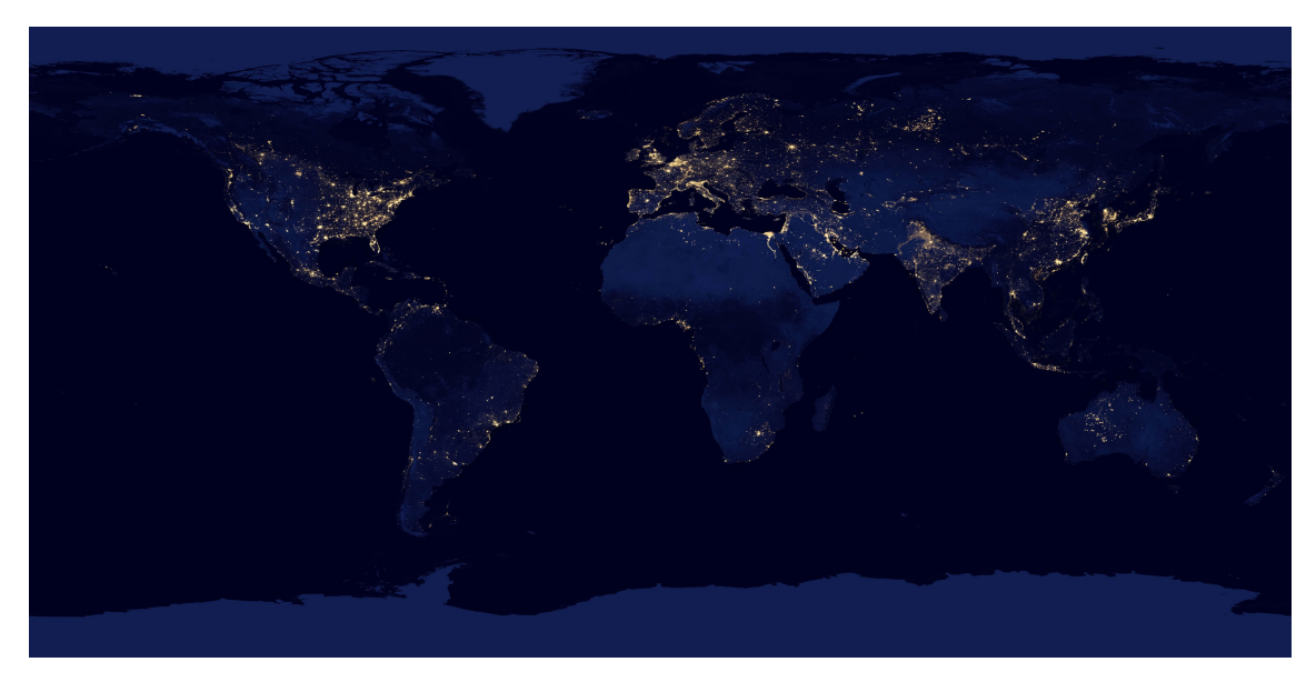
Figure 2. The satellite image of earth at night. The dark places show low access to energy and potential of high energy poverty.

energy poverty. NTL appear less useful for distinguishing differences in economic activity between poor, densely populated areas and wealthy, sparsely populated areas [91]. The latest studies looked at daylight images that can help distinguish different levels of economic well-being in developing countries [91–94].