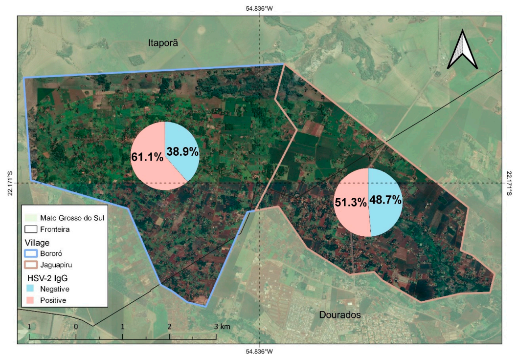
Figure 2. Distribution of anti-HSV-2 IgG prevalence positive and negative prevalence in Bororó and Jaguapirú villages (Dourados, Mato Grosso do Sul (MS), Brazil).

The use of technological devices such as cell phones and HSV-2 IgG prevalence was reported by 55.1% with an O.R of 0.73 (0.57–0.94) and a p -value of 0.01, and internet use was observed in 30.9% with an O.R of 0.41 (0.4–0.54) and a p -value less than 0.001; this can be compared to the proportions of Indigenous people who did not use the internet (69%) and cell phones (44.8%).