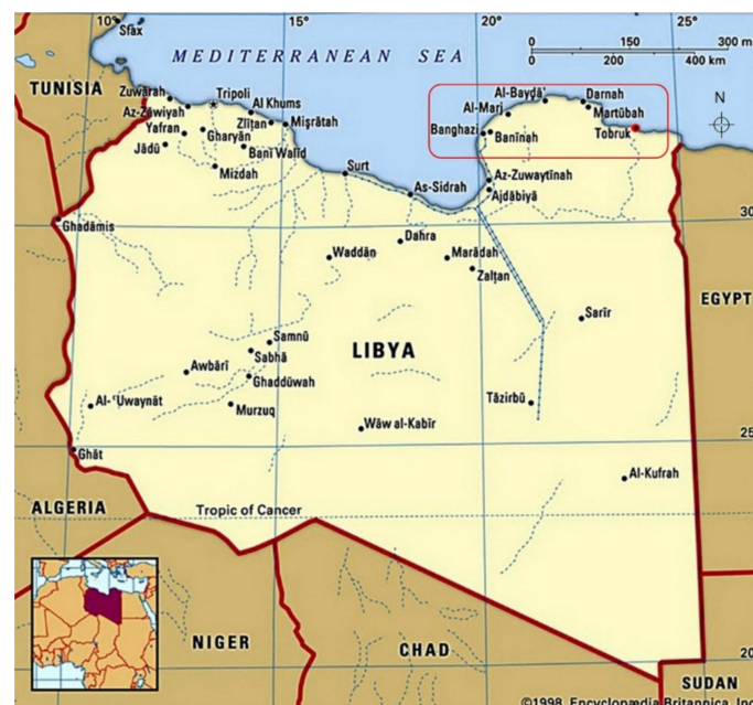
Figure 1. A map shows the location of Tobruk city and the neighboring cities (within the red blank). Reprinted with permission from ref. [9]. Copyright 2022, Encyclopædia Britannica.