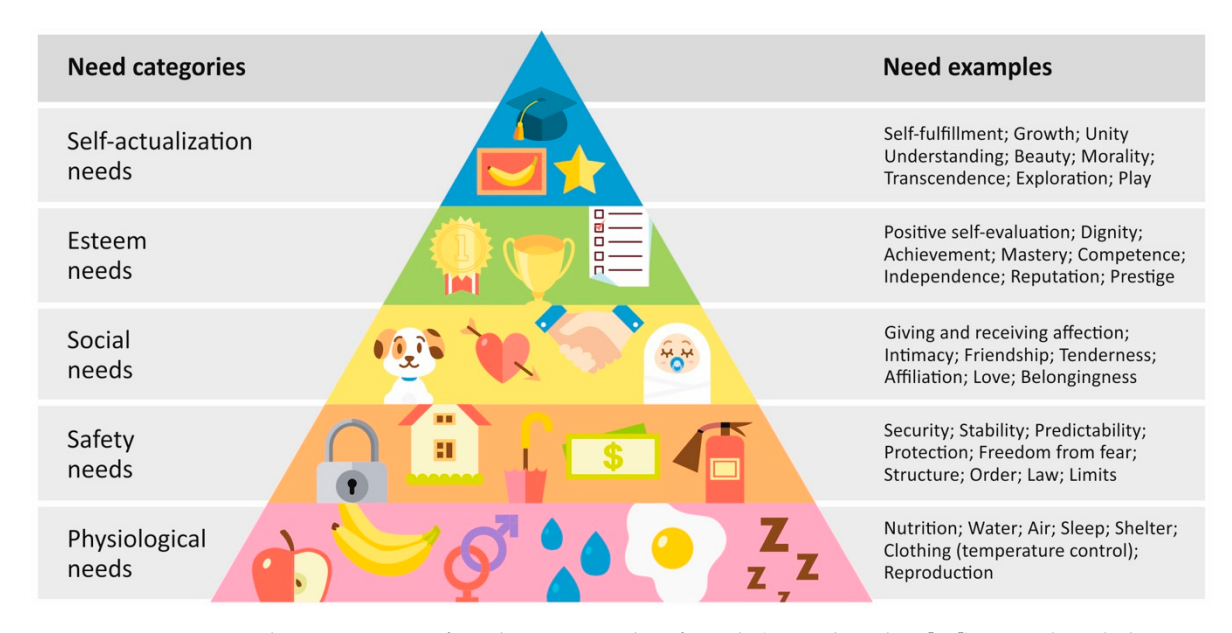
Figure 1. Pyramid representation of Maslow's Hierarchy of Needs (image based on [31]). Even though the popularity of Maslow's theory is partly attributed to the iconic appeal of the pyramid (or, more accurately, the triangle), Maslow himself never used the triangle image. In a recent paper, Bridgman, Cummings, and Ballard [34] traced the origins of the triangle visualisation to a manuscript of the consulting psychologist Charles McDermid [35]. After that, the image was popularized by management textbooks.

The heart of Maslow's motivational theory is his hierarchy of needs, often visualized as a pyramid (Figure 1). The hierarchy includes five categories, starting with physiological needs at the base, moving upward to safety needs, social needs, esteem (or ego) needs, and finally, self-actualization needs. In brief, Maslow proposed that humans have to satisfy their biological needs first, then they can seek order and predictability within their lives, a sense of personal worthiness and importance, love and affection with important others, and finally, a sense that they are moving toward an ideal version of themselves. Table 1 gives a more elaborate overview of the five need categories.