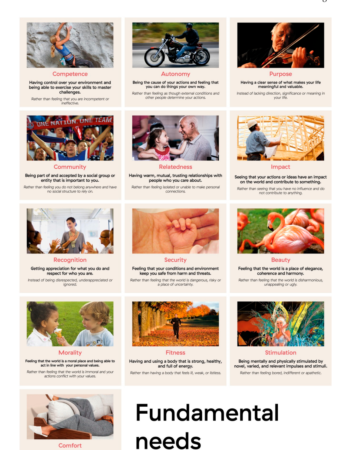
Figure 4. Illustrated overview of the fundamental needs typology.

needs with an average rating of 1.0 or higher are highlighted. We decided to place the needs profiles on the back to support the educational card usage. Students are first given the cards (and asked not to look at the back side) and invited to envision which fundamental need(s) the designs might fulfil. Next, they can look on the back of the card to compare their vision with the needs profile. This procedure serves as a conversation starter for a discussion about fundamental needs in relation to design.