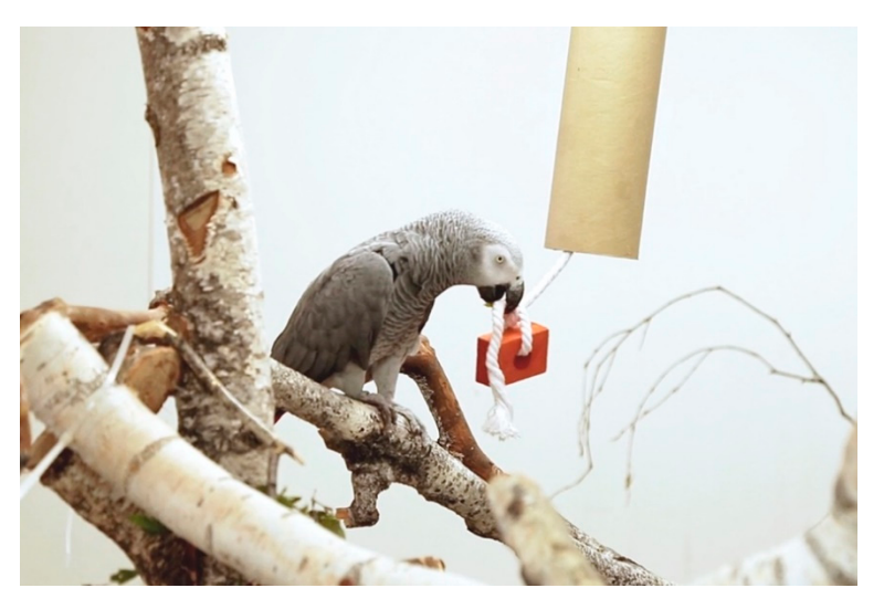
Figure 3. Rosi playing the chime instrument.

The parrots interacted with the chime instrument by pulling on the rope with their beak or a leg; nibbling and destroying the piece of wood attached to the rope; or, less frequently, nibbling on the cardboard resonator. Mostly, they interacted with the attached piece of wood, and it is therefore questionable to what extent the responsive sound of the instrument was the motivation for the interactions. The color of the attached piece of wood, we observed more interactions than with other colors. Through these interactions, a sound carpet was created, which could subsequently be picked up by a microphone.