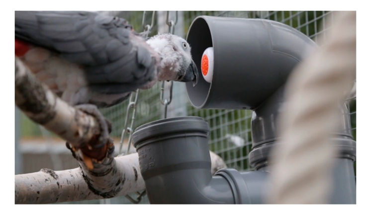
Figure 7. Cocomiso interacting with the vox instrument.

The grey parrots interacted with the vox instrument by nibbling and chewing on the microphone and the pipe with their beaks and showed responses to the instrument's sonic feedback. A direct speaking or singing into the microphone or call-and-response interaction with vocalizations has not been observed so far.