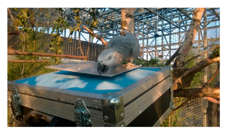
Figure 2. Billy playing the gong instrument.

The gong instrument (Figure 2) had been developed by alien productions for a previous exhibition as part of the initial metamusic project. The instrument consists of a floating metal plate, which is mounted with metal springs on top of a case. The plate is equipped with a piezo pickup for sensing the impact interactions, and the case houses and protects the necessary electronic equipment. The gong is a percussive instrument in which the grey parrots generate sound by pecking with their beak onto the metal plate. In the exhibition installation, these pecking sounds were amplified, manipulated with sound effects such as reverb effect and played back to the parrot aviary via a general PA system. Since pecking is a natural territorial behavior in parrots, the instrument was very well-received and used regularly. However, the smooth surface of the instrument made it difficult for the parrots to walk and rest on the instrument. For this reason, blue sandpaper was applied to the surface of the case of the instrument. It remains unclear how the sounds which were played back to the aviary affected the other grey parrots. During our observations, we were unable to detect any stress behavior such as other birds in the aviary fleeing, but we generally suggest that the sound should preferably come directly from a speaker inside the instrument to not affect other parrots in the aviary.