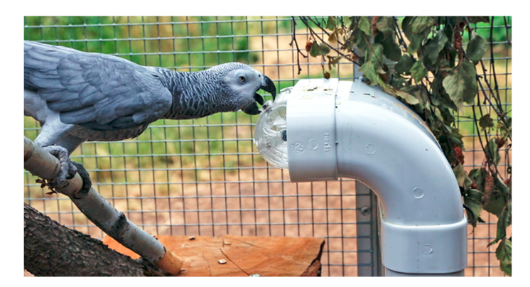
Figure 9. Wittgenstein on reel instrument.

The following concept of the reel instrument (Figure 9) is like the DJ instrument in that it is based on an enrichment toy for creating a challenging and playful process for the parrots. With this toy for physical and cognitive enrichment, the parrots must turn four wheels with their beaks to collect their treats. We equipped the four wheels with magnets that could individually activate reed switches to trigger different sounds. As previous experiments have shown, percussive sounds are well-received by the grey parrots and therefore we used drum sounds for this instrument. Each of the four wheels has been assigned a specific drum sound. By turning the wheels, the individual sounds are triggered, and turning different wheels allows the parrots to generate rhythmic drum sequences. The instrument includes a Raspberry Pi computer, an Arduino board, an amplifier and a speaker for direct sound feedback. Grey parrot Wittgenstein and others showed interest in interacting with the device and used it. The grey parrots triggered different drums sounds and responded with bobbing their heads and utterances.