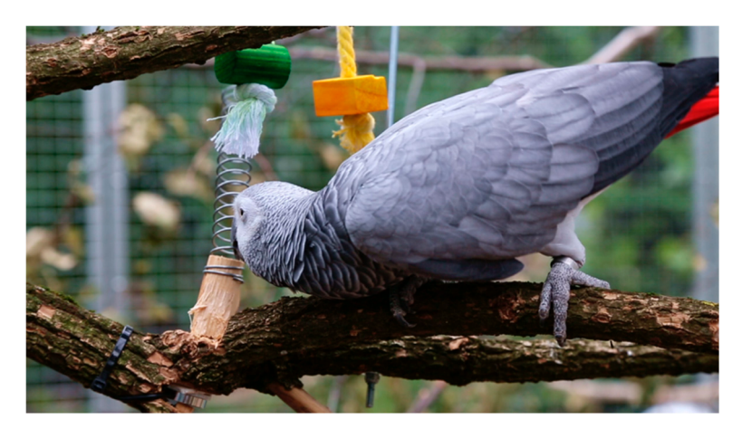
Figure 4. Nepomuk and detail of the branch instrument.

We could not observe a change in the grey parrots' behavior due to the sounds generated by their actions.