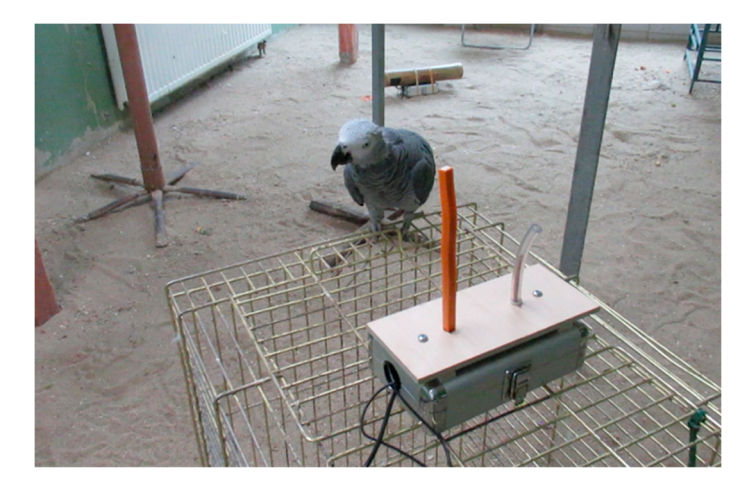
Figure 8. Prototype for a drum sequencer instrument with bending ruler.

The following concept of the reel instrument (Figure 9) is like the DJ instrument in that it is based on an enrichment toy for creating a challenging and playful process for the parrots. With this toy for physical and cognitive enrichment, the parrots must turn four wheels with their beaks to collect their treats. We equipped the four wheels with magnets that could individually activate reed switches to trigger different sounds. As previous experiments have shown, percussive sounds are well-received by the grey parrots and therefore we used drum sounds for this instrument. Each of the four wheels has been assigned a specific drum sound. By turning the wheels, the individual sounds are triggered, and turning different wheels allows the parrots to generate rhythmic drum sequences. The instrument includes a Raspberry Pi computer, an Arduino board, an amplifier and a speaker for direct sound feedback. Grey parrot Wittgenstein and others showed interest in interacting with the device and used it. The grey parrots triggered different drums sounds and responded with bobbing their heads and utterances.