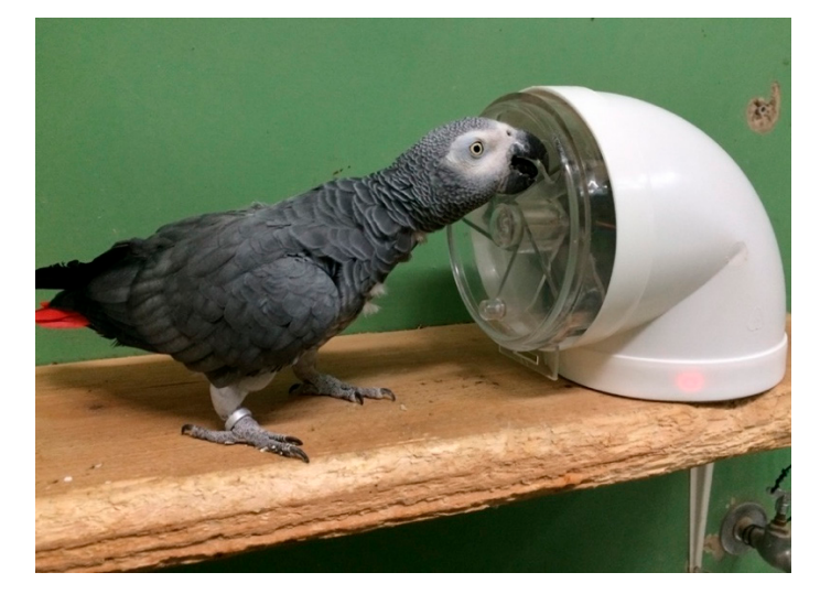
Figure 5. DJ instrument played by grey parrot Pauli.