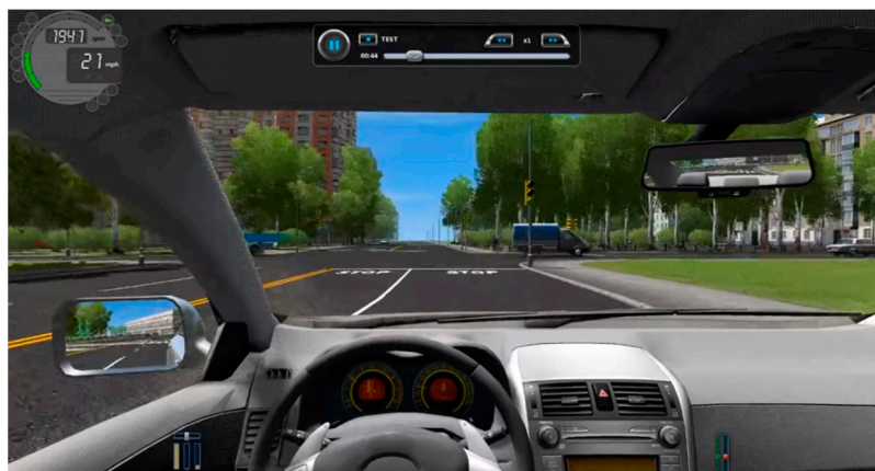
Figure 2. A capture from the simulation.

City Car Driving software was used to generate the driving simulation (see Figure 2). This software is commercially available and allows users to practice basic driving skills in a realistic city environment [41]. To generate an autonomous car experience, a driving simulation scene was recorded while a researcher drove the car. This recording, along with verbal prompts provided by an AVVA, were played back during the study.