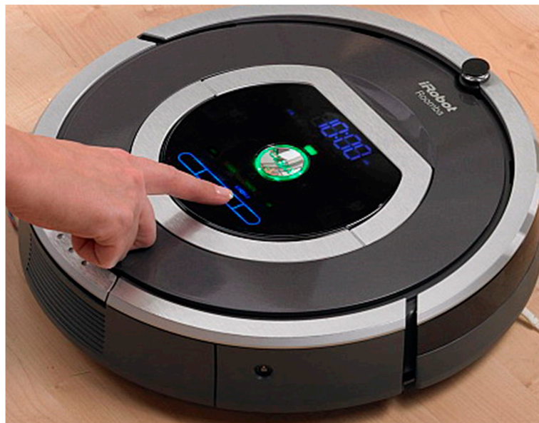
Figure 2. A photograph of the new robot vacuum cleaner iRobot Roomba 700 Series. Image by Nohau. CC BY-SA 3.0; https://commons.wikimedia.org/wiki/File:Робот_пылесос_Roomba_780.jpg . Cropped and resized to fit.

iRobot's Roomba (Figure 2) has been a very popular choice of robot when it comes to studies at home for several years. It is a robot vacuum cleaner, designed by a commercial company, and priced in a range akin to higher end domestic appliances (£349.99–£799.99 [31]). While many studies have discussed the social dimensions people ascribe to Roomba [32–34], and this is one of the few robots that has been evaluated over a long period of time in a domestic setting [35,36], it falls severely short of being able to communicate with people in a human-like manner, thus it should not be considered an SDR. Still, given that the robot is relatively well researched, we consider, in this article, the framework of robot acceptance, which has been largely based on considerations of interactions with Roomba devices.