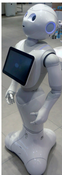
Figure 4. Pepper by Aldebaran Robotics and SoftBank.

Pepper (Figure 4) is a robot developed by Aldebaran Robotics and SoftBank in Japan. It is a 1.2-m robot on a wheelbase with arms. Its capabilities are advertised [58] to include emotion recognition as in joy, sadness, anger and surprise; it can also recognize facial expressions like frown or smile as well as the tone of voice. Simple non-verbal clues like angle of a person's head is also said to be recognizable.