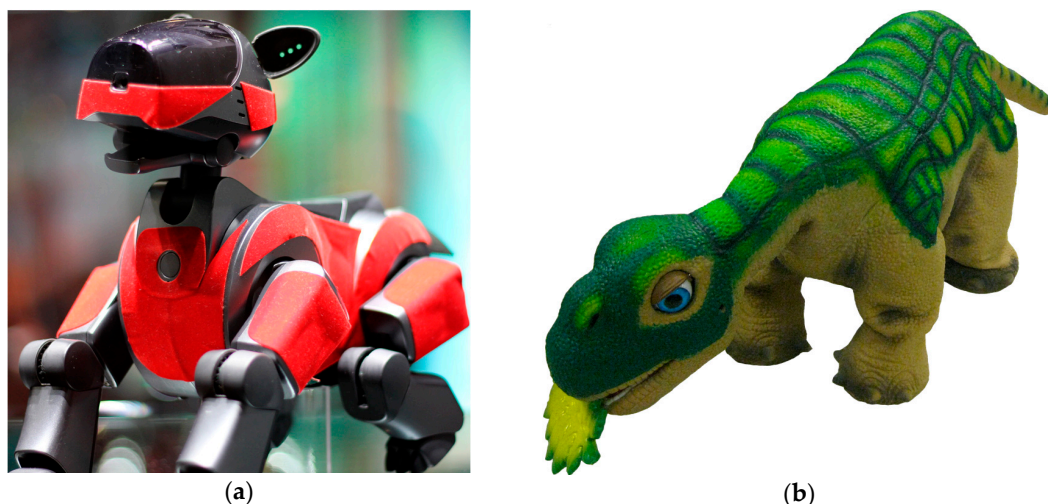
Figure 3. Other robotic domestic technologies: (a) AIBO by Sony. Image by Sven Volkens. CC BY-SA 4.0; https://commons.wikimedia.org/wiki/File:Aibo-DASA.JPG . Cropped and resized to fit; (b) Pleo robot (by Ugobe). Image by Jiuguang Wang. CC BY-SA 3.0; https://commons.wikimedia.org/wiki/File:Pleo_robot.jpg ; Cropped and resized to fit.

Pleo (Figure 3b) is a robotic dinosaur. While being quite a sophisticated device, what little evidence we have of its long-term use suggests that it was positioned as a toy in the minds of the participants [41]. This is further supported by a blog-post analysis related to the toy [42]. Pleo falls short in its communication modes as well, being, again, some way away from “human-like”.