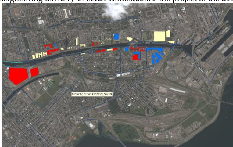
Figure 2. Use of G.I.S. in the Brownfield Lachine Canal (Montréal, Canada). Legend: In red the industrial buildings; in yellow the new constructions and in blue the historical building and the blue lines the bicycle paths.

As shown in Figure 2, the use of G.I.S. has consisted in selecting services all inside the brownfield and also in its surroundings. In this phase the use of G.I.S. was used to select the functions of the services related to the territory. In this way we will identify the indicators that are in relation with the neighboring territory to better contextualize the project to the territory.