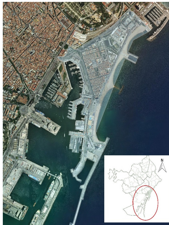
Figure 9. Location of the Barceloneta neighborhood.

This old seaside district (the beach neighborhood), traditionally popular and working class, is strong in character. Urban contrasts exist between the maritime front (the promenade and beaches of San Miguel, San Sebastián, and Barceloneta-Somorostro), and the western border (Moll), and between large corporate headquarters buildings (Gas Natural or Mapfre), casinos, and hotels (Arts) and the residential nucleus, where traditional housing coexists with novel social housing (the MTM (Maquinista Terrestre y Marítima) project, Figure 10a). All of this shares an area limited by the sea and by urban pressures to densify the use of space. Notable are successful drives by local associations (the Ostia and the Platform in Defense of Barceloneta, now united as “La Barceloneta diu prou”) to halt projects deemed harmful to the neighborhood [29].