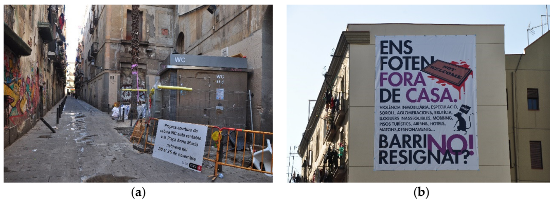
Figure 6. El Raval: (a) rubbish and deterioration, and (b) neighborhood demands.

Our qualitative analysis reveals multiple problems linked to the urban environment such as: the lack of green spaces (the Jardins de Sant Pau del Camp and Rubió i Lluch being exceptions, in addition to the Plaza de Josep Folch); noise pollution and garbage (Figure 6a); difficulty in physical mobility due to the layout and narrowness of streets, and to problems derived from the scarcity of parking; and housing issues including superannuation, poor maintenance or reform, overcrowding, lack of basic facilities and, more recently, tourism outsourcing. Regarding the social environment, the main problems detected here include: difficulty of immigrants to integrate, with clear spatial differentiation by group; the gradual orientation of economic activities towards tourism, with the consequent loss of traditional trade; explicit insecurity, evidenced by robberies of tourists; the marginal activities described above; and the increase in real-estate pressures driven by gentrification (Figure 6b).