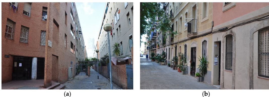
Figure 10. La Barceloneta: (a) social housing in MTM, and (b) small houses.

Within the neighborhood, problems related to the urban environment include: the lack of green spaces (only Barceloneta Park, located at one extreme, is significant); difficulty in physical mobility, both for vehicles and pedestrians, given the narrowness of streets in the residential nucleus; the small number of surface parking spaces; housing concerns related to antiquity, poor maintenance, lack of facilities, and sometimes over-occupation (infamous “houses of rooms,” Figure 10b). The excessive supply of tourist homes in the core neighborhood is also a current concern, driving out traditional residents and prompting fierce neighborhood protests (2014 saw many mobilizations under the slogan “La Barceloneta is not sold,” seeking to publicize the proliferation of tourist apartments derived from transformation of older housing into modern flats destined exclusively for rental by tourists). Finally, as elsewhere, the neighborhood has experienced a significant increase in housing prices (a more detailed analysis of the evolution of this market in La Barceloneta can be found in Pareja and Simó [30]).