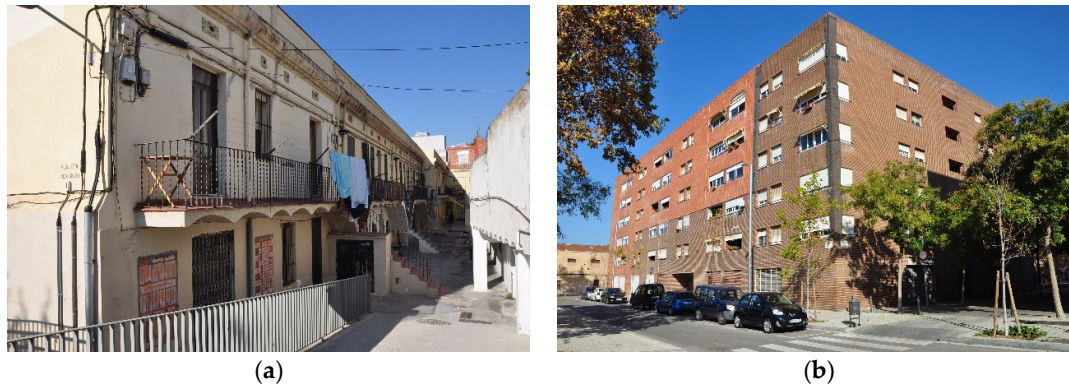
Figure 8. La Marina del Prat Vermell: (a) homes of the Bausili Colony, and (b) deterioration of modern buildings.

Finally, the neighborhood known as La Barceloneta is also located in the Ciutat Vella district (Figure 9), but its population volume and density, although quite high (16,000 inhabitants in 1.24 km 2 , or 12,900 inhabitants per km 2 ), are lower than in nearby Raval. The percentage of foreign residents (31.3%) is the second highest among the neighborhoods analyzed.