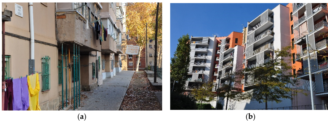
Figure 4. Trinitat Nova: (a) housing pending demolition, and (b) new homes.

The Trinitat Nova neighborhood, largely populated by the working class and immigrants, exhibits socio-demographic characteristics that could clearly be improved, as repeatedly demonstrated by historical and current association and protest movements. The Community Plan of Trinitat Nova (and its corresponding diagnoses), launched in 1996 on the initiative of the Neighborhood Association, has led to development of an innovative instrument and integrator of