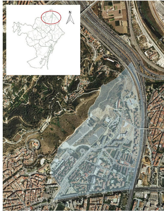
Figure 3. Location of the Trinitat Nova neighborhood.

improvement of accessibility via the metro, and integration into the ECO-City Project (financed by the European Community within its Fifth Framework Program for Research and Development). The second intervention, the Trinitat Nova Urban Initiative of 2007–2013 (20 million euros) continued the process of integral urban regeneration supported by European and municipal funds. Currently, the Barrios Plan of 2016–2020 ( http://pladebarris.barcelona/es ), promoted by the Barcelona City Council, consists of ten plans involving 16 city neighborhoods in the city, targeting integrated actions in education, social rights, economic activity, and urban ecology, with a planned investment of more than 150 million euros. Of the four cases analyzed here, three (Trinitat Nova, Raval, and La Marina del Prat) are featured in some of these plans. Trinitat Nova will, without a doubt, see the reduction or elimination of a good many existing problems.