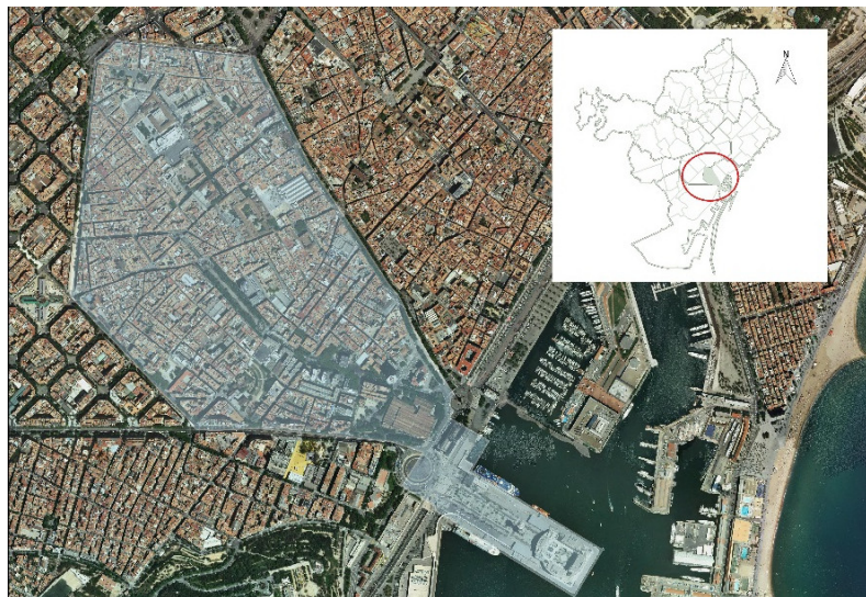
Figure 5. Location of the Raval neighborhood.

For its part, the Raval neighborhood, long regarded as the Chinese neighborhood (denomination coined by journalist Paco Madrid in an article published in the weekly El Escándalo newspaper, in reference to the “chinar” technique employed by many pickpockets of that time) or a rogue area, is located in the Ciutat Vella district (Figure 5). Its defined boundaries are Parallel Avenue to the south (dividing it from the Poble Sec neighborhood); Sant Pau and Sant Antoni Avenues (separating Raval from the Sant Antoni district); and Pelayo Street and La Rambla, marking the division from the adjacent Gothic Quarter. Two large urban projects, Rambla del Raval and Illa Robadors, are located within the zone.