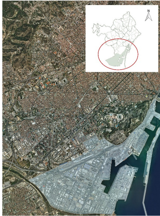
Figure 7. Location of the La Marina del Prat Vermell neighborhood.

This small neighborhood's origins were oriented to agriculture and livestock, and it is located between Montjuïc mountain and the Zona Franca industrial sector. The stamp of the Primo de Rivera regime was visible in the promotion of cheap "Eduardo Aunós" houses of 1929, the demolition/relocation of which in the 1990s made room for today's constructions. Some historic industrial (often obsolete) buildings survive, along with scattered residential nuclei (Figure 8a).