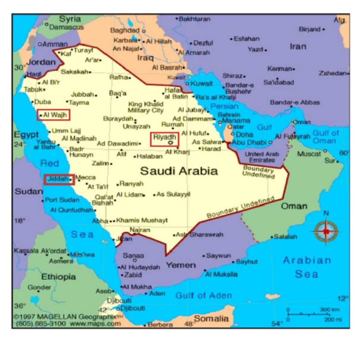
Figure 1. Map of Saudi Arabia, with red boxes pointing to the locations where camel milk samples were collected from private farms.

The animals were located in different private farms in northern Jeddah (16 female, four from each ecotype), Riyadh (28 female, 6 from each ecotype), and Alwagh (16 female, four from each ecotype) governorates, Saudi Arabia (Figure 1), covering a large part of Saudi Arabia (area ~500.000 Km, Figure 1).