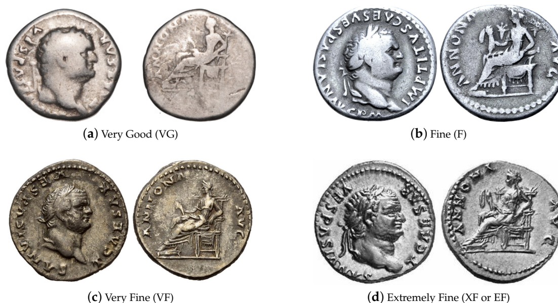
Figure 1. Examples of the same coin type (denarius of emperor Titus; RIC 972 [Vespasian], RSC 17, BMC 319) in different grades of conservation: (a) very good (VG), (b) fine (F), (c) very fine (VF), and (d) extremely fine (XF or EF). The two lower grades, namely fair (Fr) and good (G), are not shown due to the lack of interest in specimens damaged so severely.

Our counter-argument and indeed the motivation for the present work is manifold. Firstly, considering the challenge that determining a coin's type is proving to be, we observe that a human expert approaches this task in several stages. One of these is the narrowing of possible options by determining the denomination of the coin (it is worth remembering that the number of types of Ancient Roman Imperial coins exceeds 43,000 as estimated by Online, http://numismatics.org/ocre/ , a joint project of the American Numismatic Society and the Institute for the Study of the Ancient World at New York University). Secondly, we note that the most common denominations used during the existence of the empire, namely dupondii, ases, sestertii, and denarii were made of different materials. As such, the hypothesis we made was that this first, coarse categorization of coins can be done using colour as one of the main features. An additional benefit of this approach lies in its non-reliance on the preservation condition of specimens—the material remains unchanged even if major visual features are destroyed, see Figure 1.