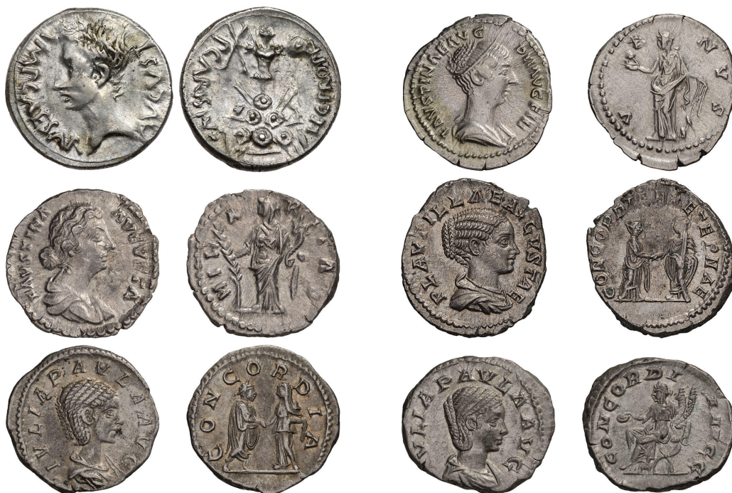
(b) Examples of denarii