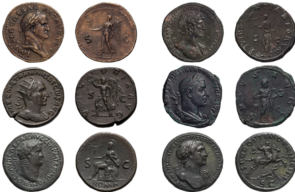
(a) Examples of sesteratii