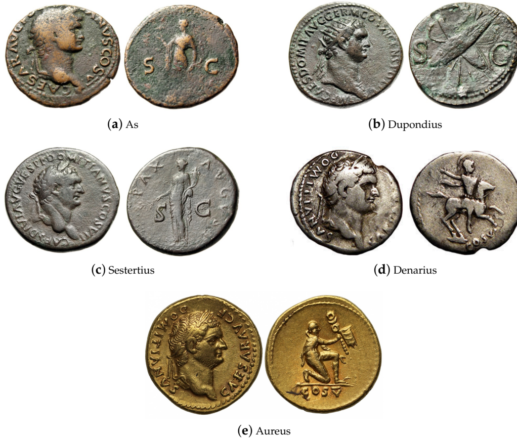
Figure 2. Coins of different denominations of the same emperor, Domitian. Shown are, in order of value at the time of their use, examples of an (a) as, (b) dupondius, (c) sestertius, (d) denarius, and (e) aureus.

is taken into account that the exact composition of each denomination varied across time and that various environmental factors effected chemical changes, particularly on coins' surfaces, which can alter appearance significantly.