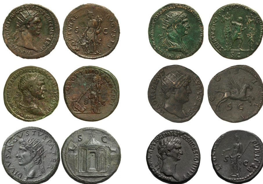
(b) Examples of dupondii