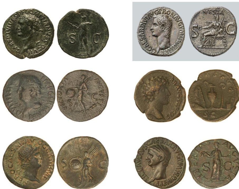
(a) Examples of ases