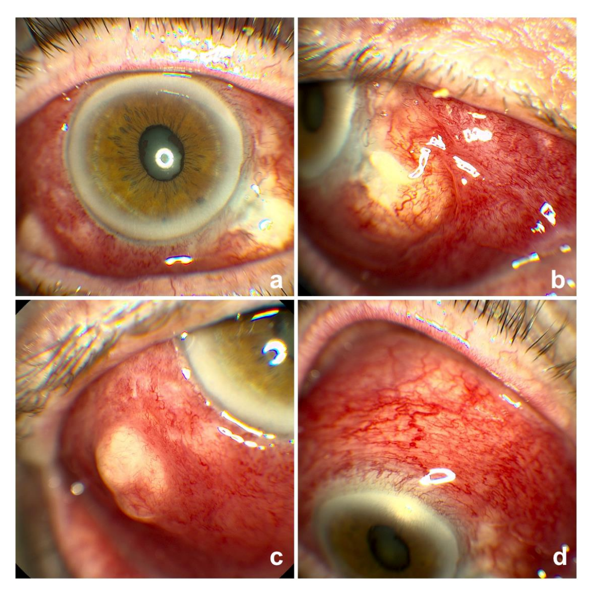
Figure 1. Right with scleritis at presentation 3 months after the procedure. ( a ) Axial view; ( b ) Inferonasal part of the sclera (primary site of the procedure); ( c ) Suspicious lesion which was biopsied and found to be just an inflammatory mass at this presentation; ( d ) Extensive scleritis.

On examination, visual acuity was 20/200 (corrected 20/60) in the right eye, and 20/10 in the left eye. The left eye was structurally normal. Intraocular pressures were normal. Fundus examination was normal. Ultrasound B-scan and a gentle ultrasound biomicroscopy showed no intraocular mass lesion.