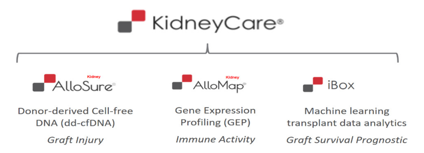
Figure 1. Multimodality testing using dd-cfDNA, GEP and machine learning to better assess organ health and enable the optimization of immunosuppression.