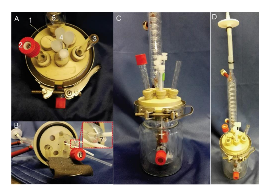
Figure 2. Pictures of the assembled BES reactor. ( A ) top-view; ( B ) bottom view of the lid; ( C ) and ( D ) overview from the side. 1, working electrode electric wire; 2, top-end of the bridging tube; 3, top-end of the counter electrode compartment; 4, four-port plug for gassing, sampling and feeding; 5, condenser; 6, bottom-end of the counter electrode compartment, sealed by an ion exchange membrane; 7, bottom-end of the bridging tube, sealed by porous glass frit (pore size of < 1 \mu m ).