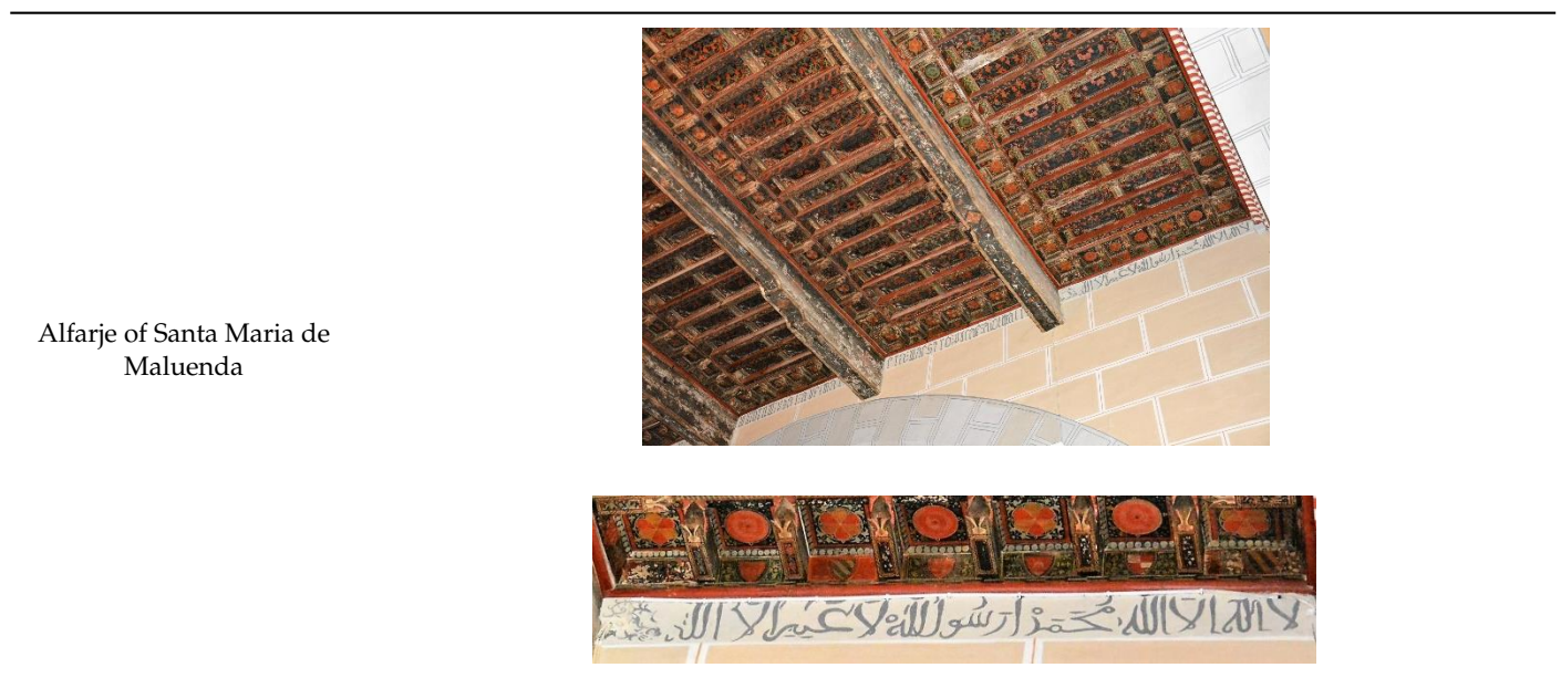
Table A2. Example of a notice: Inscription of Santa María de Maluenda.