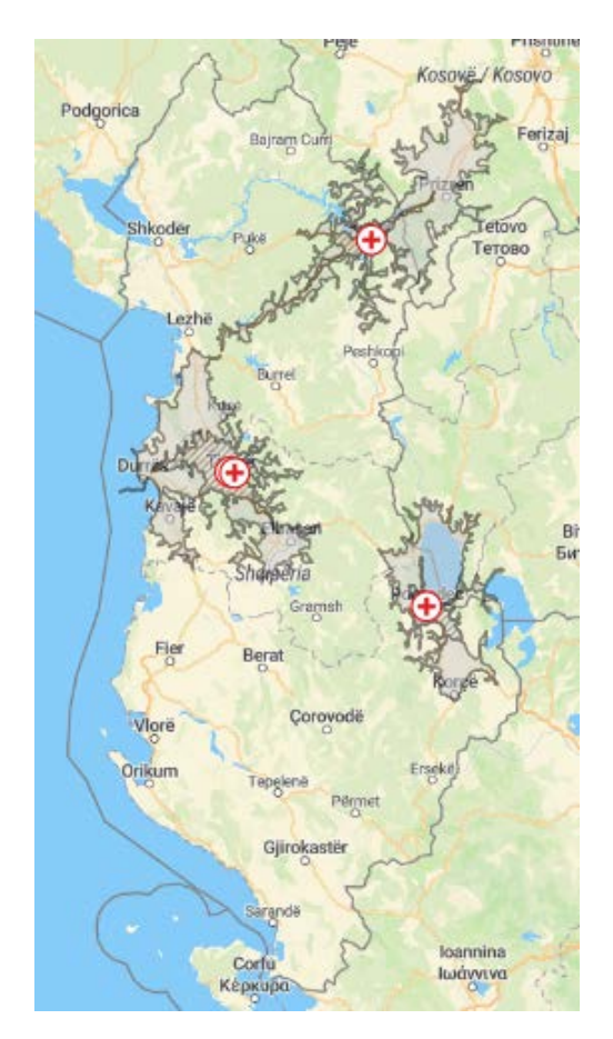
Figure 1. Map of Albania. ⊕ marks the four maternity hospitals: two in Tirana, one in Pogradec, and one in Kukës. The striped area marks the region around each maternity hospital within a travel time of 30 min by car. The grey area marks the region around each maternity hospital within a travel time of 60 min by car.

WB were first screened before discharge from the maternity hospital, between 24 and 48 h after birth (Figure 2). When indicated, the second screening step was scheduled two weeks after the first screening step and the third screening step was scheduled two weeks after the second screening step. Infants who did not receive a pass result in both ears on completion of screening were referred to Tirana for diagnostic audiological assessment and subsequent intervention. This took place at the Tirana University Hospital Centre (TUHC) or the Child Centre for Rehabilitation (CCR).