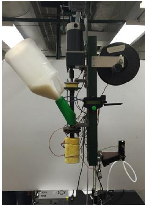
Figure 3. Vertical recyclebot. The white hopper is on the upper left and the black spooler is on the upper right. The motor in the upper middle drives an auger that feeds plastic into the hot zone (insulated in yellow). Filament is produced and looped through a light sensor to maintain the loop length, and thus the filament diameter, automatically. In this setup, the length and diameter can be measured continually.