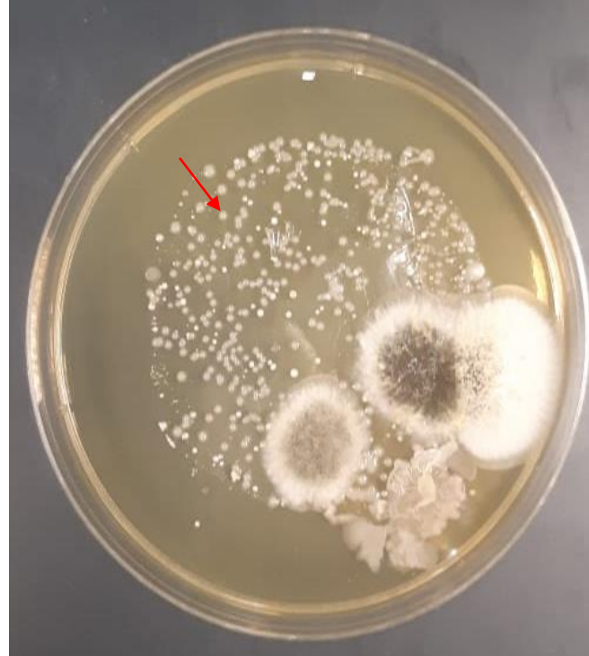
Figure S1. Isolation source and initial isolation, deteriorated apple fruit (a); microorganisms obtained from rotten apple (b). The red arrow indicated the most abundant bacterial isolate obtained, which was then selected for the subsequent studies.