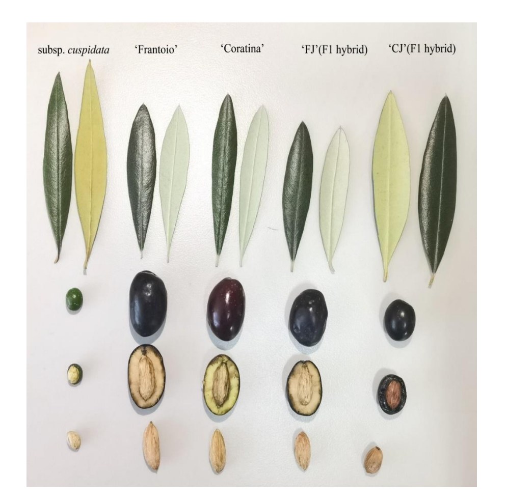
Figure 1. Morphological characters of leaf, fruit and endocarp for O. europaea subsp. cuspidata , 'Frantoio', 'Coratina', 'FJ' and 'CJ' from left to right in the line.