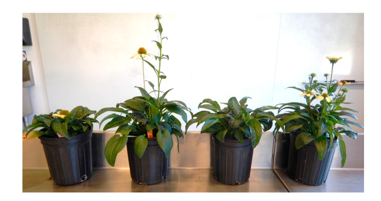
Figure 2. Representative plants of 'Mellow Yellow' coneflower at the conclusion of the 69-day experiment. Plants were maintained at either 40% VWC or 18% VWC and received either 100% (12 g/plant) or 50% (6 g/plant) of the medium bag rate of controlled release fertilizer. Treatments were 18% VWC 50% (6 g/plant) CRF, 40% VWC 50% CRF, 18% VWC 100% CRF, and 40% VWC 100% CRF (left to right).

Leaf size of astilbe was greater for the 40% VWC treatment (81.6 cm<sup>2</sup>) than the 18% VWC treatment (36.2 cm<sup>2</sup>, Table 3). There was no significant VWC or fertilizer rate effect on leaf size of coneflower (Table 4). Leaf size of Penstemon 'Ruby Candle' was also not affected by fertilizer or irrigation treatment [23]. Conversely, leaf size of Hibiscus acetosella 'Panama Red' [20] and Petunia x hybrida 'Dreams White' were reduced with lower irrigation rates [15]. Cell elongation is reduced with water stress and is an indicator of drought stress in plants [24]. This suggests that the reduced irrigation treatment caused water stress induced reduced growth for astilbe but not coneflower.