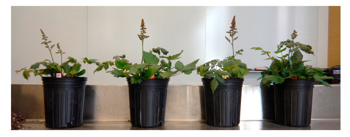
Figure 1. Representative plants of 'Visions' astilbe at the conclusion of the 61 day experiment. Plants were maintained at either 40% VWC or 18% VWC and received either 100% (12 g/plant) or 50% (6 g/plant) of the medium bag rate of controlled release fertilizer. Treatments were 18% VWC 50% (6 g/plant) CRF, 40% VWC 50% CRF, 18% VWC 100% CRF, and 40% VWC 100% CRF (left to right).

appearance and size are commercially acceptable allowing for the reduction in inputs. The results of this study suggests that substrate volumetric water content has a greater effect on growth of astilbe (Figure 1) than coneflower (Figure 2).