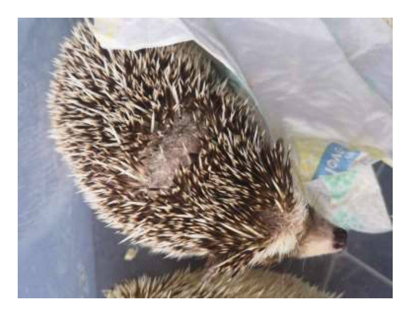
Figure 2. Lesion on the back of an African pygmy hedgehog due to infection by T. erinaceus .

It is important to note that the course of T. erinacei infection in hedgehogs can vary. While some individuals may display noticeable clinical signs, others may experience only mild or even asymptomatic infections. This variability underscores the complexity of the disease in hedgehogs [2,8,19,20].