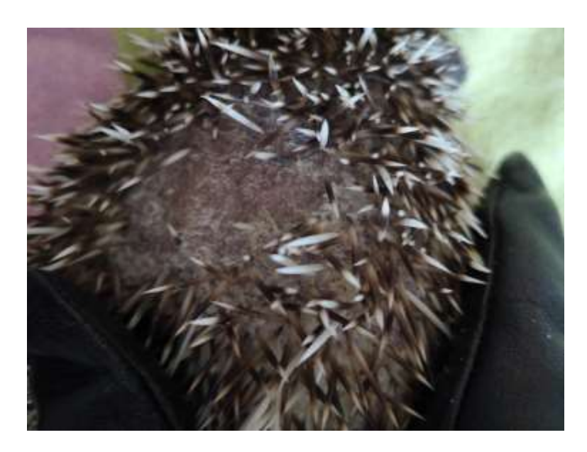
Figure 1. Crusty lesions, alopecia, and loss of spines in pet hedgehog caused by mycotic infection.