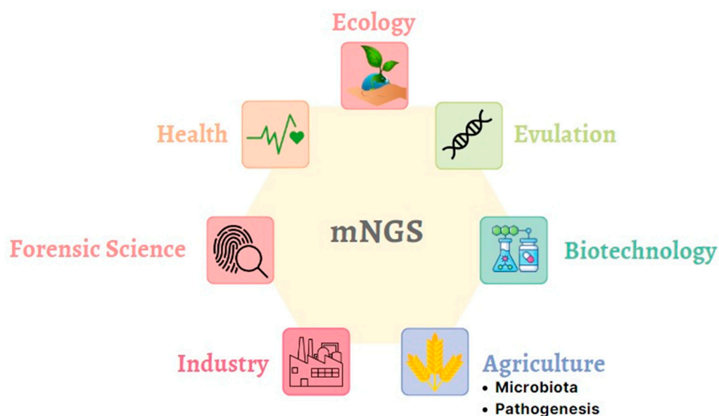
Figure 1. Applications of mNGS technology in different fields.

inventory. Environmental DNA or mixed DNA samples help us to understand the genetic microheterogeneity of bell groups [5].