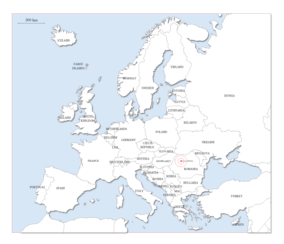
Figure 1. Location of Cluj-Napoca and North-Western Romania in Europe (map adapted from www.freeworldmaps.net).

This study presents a cross-sectional description of these laboratory data obtained between May 2016 and April 2020 by mycological diagnosis.