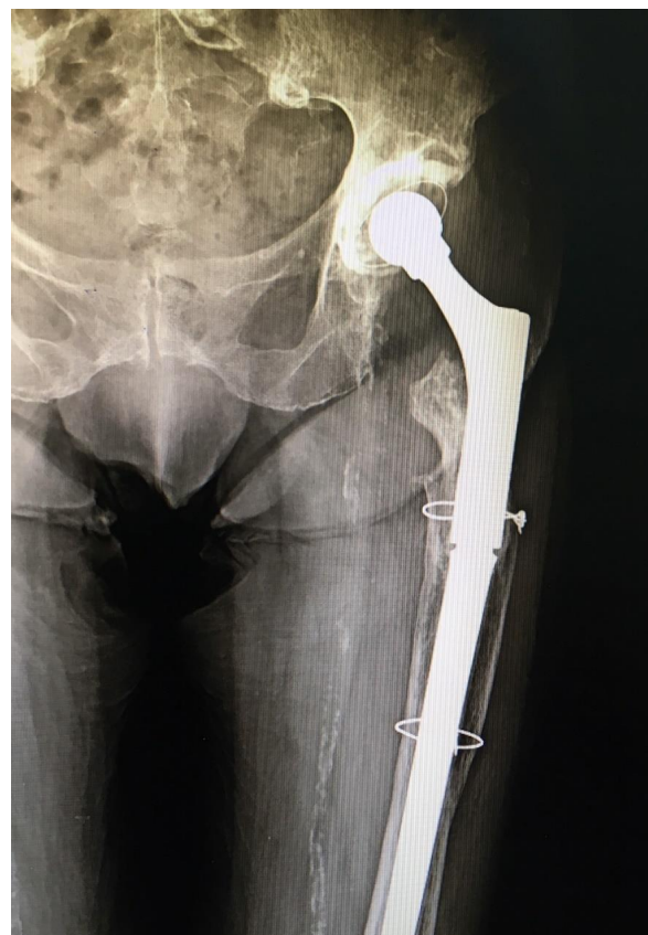
Figure 2. X-ray of the operated hip ten months after the surgery, showing a good position of the revision total hip endoprosthesis and no signs of instability.

The patient was stable throughout the duration of the surgery, with a total blood loss of 300 mL. On the second postoperative day, the patient started physical therapy, and she was verticalized with the walker. There were no perioperative complications and two and half years after surgery the patient is feeling well, has no pain in the operated hip, and walks with a walker because of her poor general condition. She has had no hip dislocations since this last operation. Postoperative follow-up X-rays show a stable hip endoprosthesis (Figure 2).