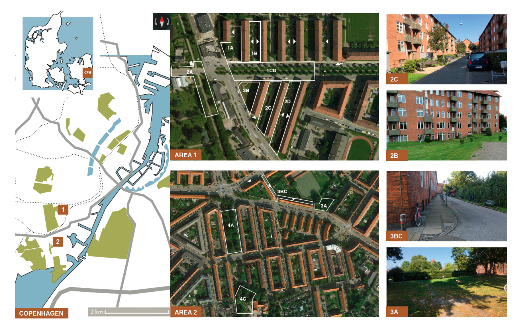
Figure 1. Map of Copenhagen, Sydhavnen and all 11 Neighborhood open spaces within the two senior housing areas. The map (on the left) includes information on parks (green), water (blue), major roads (grey lines), and the train system (dotted lines). White arrows show the entrances to the buildings.