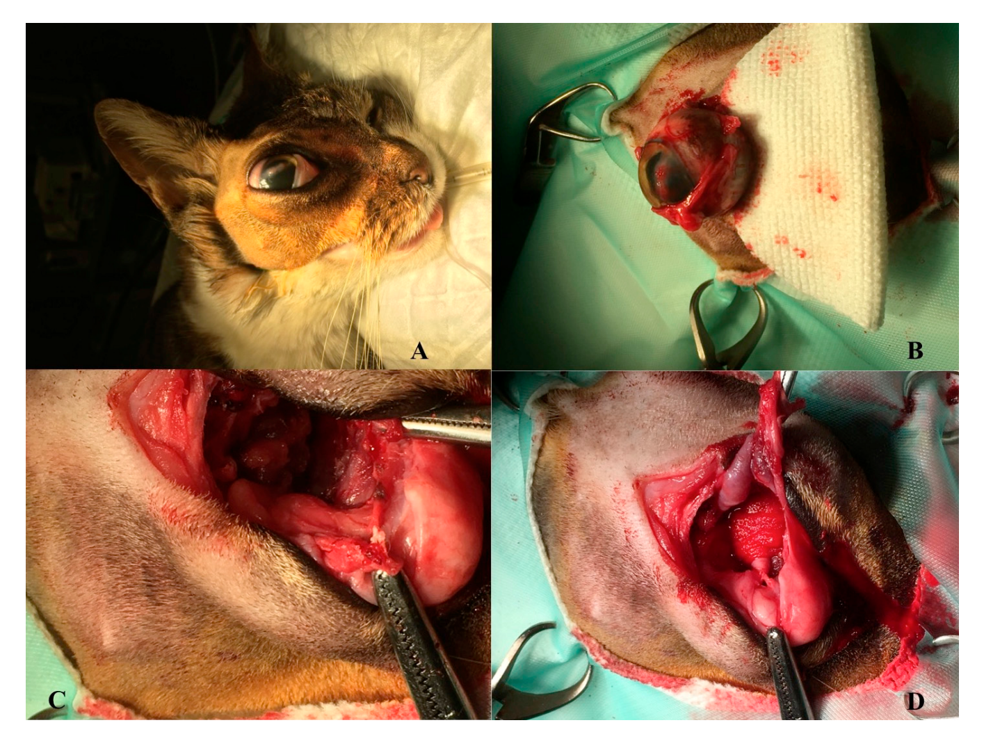
Figure 1. Gross evidence of the mass (exophthalmos) before surgery ( A ). Enucleation of the right ocular globe during the surgery ( B ). Gross evidences of the primitive multilobular mass before the total surgical excision ( C , D ).

The second clinical examination, after the surgery, performed in May 2019, revealed an aggravated status of the cat, characterized by strong depression, anorexia, weight loss 3.4 Kg (2/5 BCS), dehydration, sialorrhea, vomiting, purulent discharge from the right nostril, widespread muscle pain, dysphagia, generalized tremors, ataxia. The patient was hospitalized and treated with saline solution IV, dexamethasone (0.5 mg/kg), lincomycin (11 mg/kg), maropitant (2 mg/kg), omeprazole (1 mg/kg), tramadol (2 mg/kg). The hematological investigations were characterized by erythrocytosis (12.63 M/ \mu L), Red blood cells Distribution Width (RDW) (33.1%), low levels of eosinophils and platelets (0.07 and 92 K \mu L), glucose value of about 203 mg/dL. After 3 days, the patient was discharged due to the regression of clinical signs and a return to a normal clinical status, with a simple prescription of prednisolone and clindamycin preventive therapy.