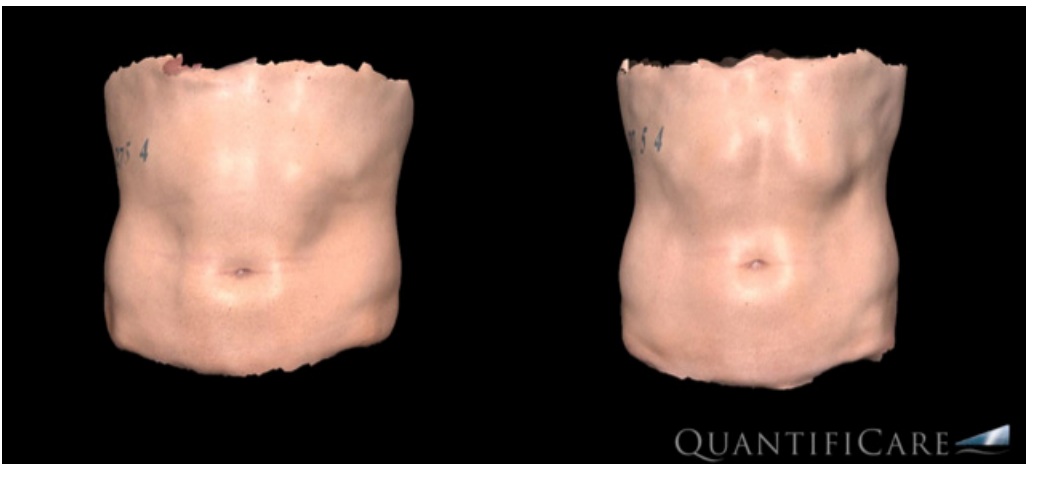
Figure 1. Three-dimensional (3D-Quantificare) optical abdominal skin surface image of a male patient before ( left ) and three months after the last treatment ( right ).