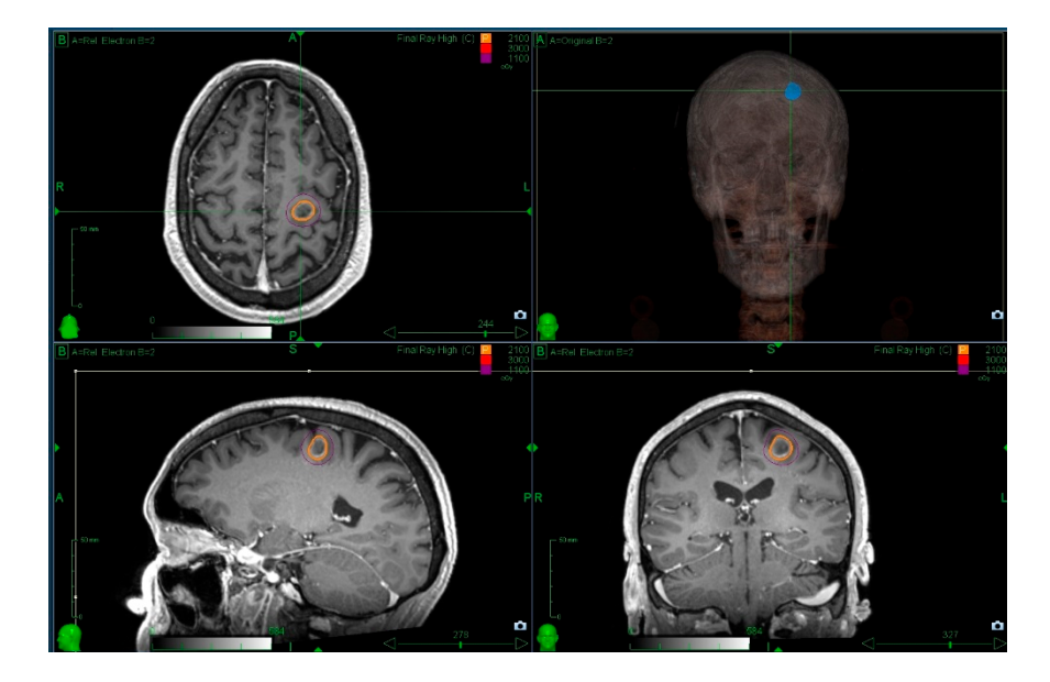
Figure 1. Radiosurgery for patients with a single metastasis and a favourable prognosis is standard practice. The figure illustrates a single metastasis covered with a prescription dose of 21 Gy prescribed to the 70% isodose line using Cyberknife. Prior informed consent was obtained for use of these images.