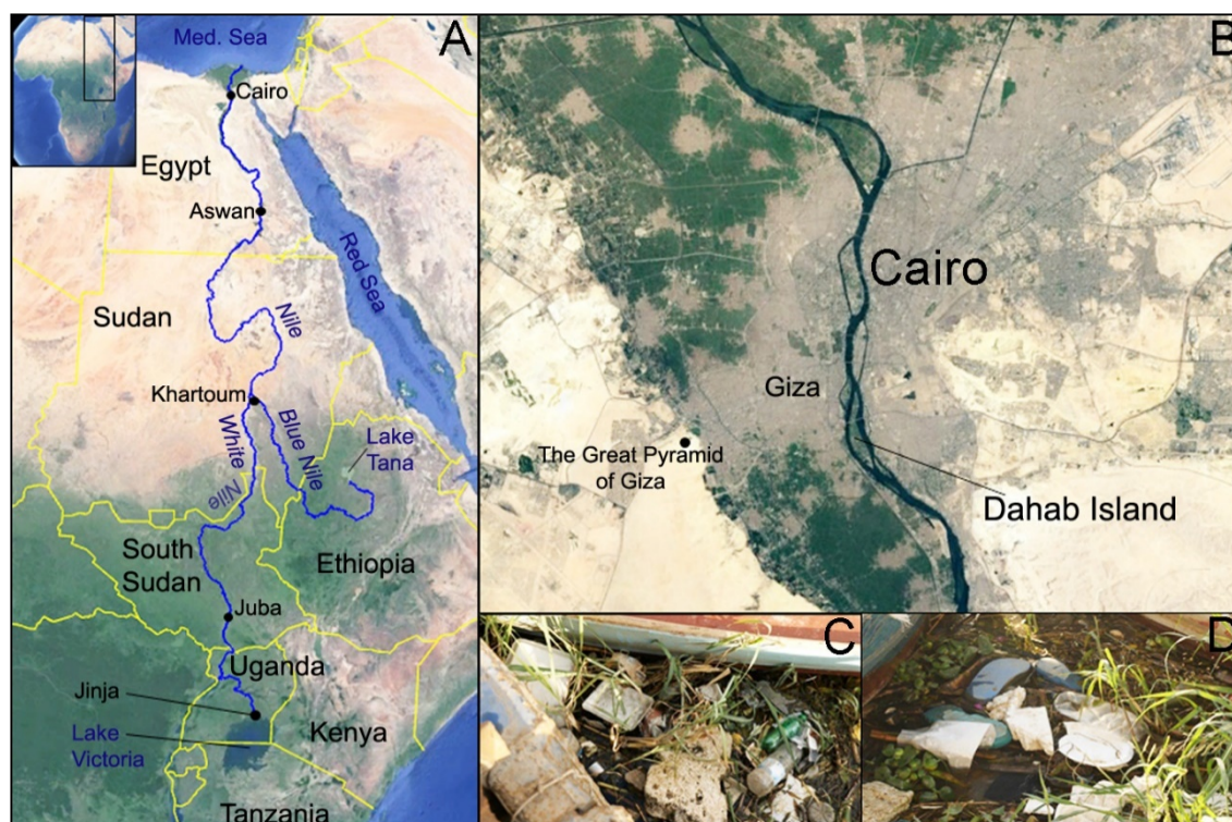
Figure 1. Path of the Nile River starting at Lake Tana (Blue Nile) and Lake Victoria (White Nile), respectively, before meeting at Khartoum and flowing toward the Mediterranean Sea via Cairo, the area of the present study (A). Fish were caught around Dahab Island in the Nile River at Cairo and purchased from markets located along the Nile Corniche on the east bank of the Nile opposite Dahab Island (B). Examples of plastic litter found close to Dahab Island and along the Nile (C,D). (Map source: Google Earth (2019) with the path of the Nile River overlaid from shapefiles [30]).

This study was conceived as part of the documentary ‘The Plastic Nile’ produced by Sky News International. It was conducted within a relatively short period of time (five days) and under a degree of confidentiality that is not usual for scientific investigations. The reason for this is that criticism of the Nile is often negatively received by the authorities, as evidenced by the case of Egyptian singer Sherine Abdel Wahab, who was sentenced to six months imprisonment for commenting on the cleanliness of the Nile River [29]. Thus, the work was performed in a laboratory within the greater Cairo area, but no further details are provided as to not identify our hosts. Moreover, they have requested not to be added as co-authors to this work, but we greatly acknowledge and appreciate their collaboration, without which this work would not have been possible.