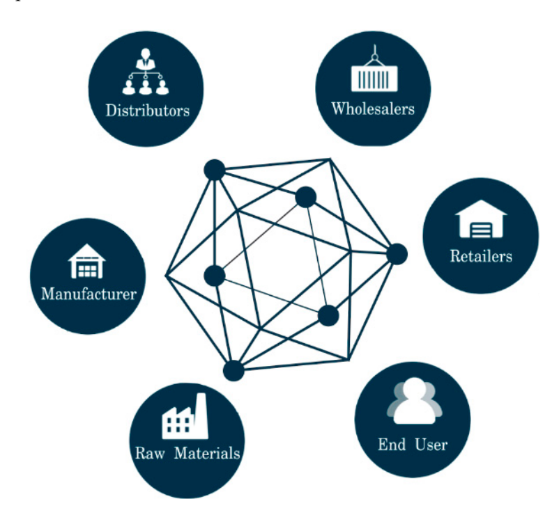
Figure 1. Supply Chain Roles (Actors) interacting with Blockchain Distributed Ledger Technology.

Figure 1 illustrates, conceptually, how the different actors of a supply chain can cooperate and interact under a blockchain network. Each participant submits transactions on the blockchain network in a specific way, depending on the completed activity. In the raw materials step, the suppliers that pre-process the natural resources are submitting transactions on the ledger concerning that initial process. These transactions include tags such as raw material name, quantity, quality, origin geo-location, and others. The moment the raw materials are starting their journey to manufacturer, the appropriate transactions are submitted. In this manner, every network party can verify important details about the specific raw material they have received or that their product is made from. Similarly, on the manufacturing stage, the manufacturer has a similar interaction with the blockchain and the next chain participant.