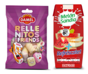
Figure 2. Products considered.

First, we tested that participants had bought the products considered in our study (candies or juice with milk, Figure 2), and, after this, they were requested to participate in our research by completing a structured and personal questionnaire. A final valid sample of 300 participants was collected (error = 5.66 if sample procedure was probabilistic). This sample size must be considered when generalizing results.