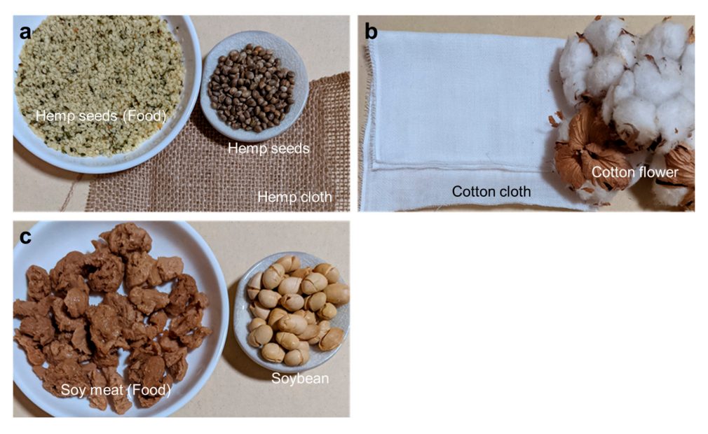
Figure 4. Examples of the industrial application of hemp (a), cotton (b), and soybean (c).

The industrial utility of hemp, cotton, and soybean is outlined in Figure 4 and Table 2. Hemp is usable as both a fiber and food material (Figure 4a). Cotton is used mostly for fiber production, while soybean for food processing (Figure 4b,c). As all seeds are available for oil expression, and the residues are utilized as a highly nutritional food material (hemp and soybean) or for fiber production (hemp and cotton), they are all deemed sustainable. However, as hemp is more sustainable than cotton or soybean in view of cultivation and utility, ++ was marked only for hemp in the sustainability row (Table 2).