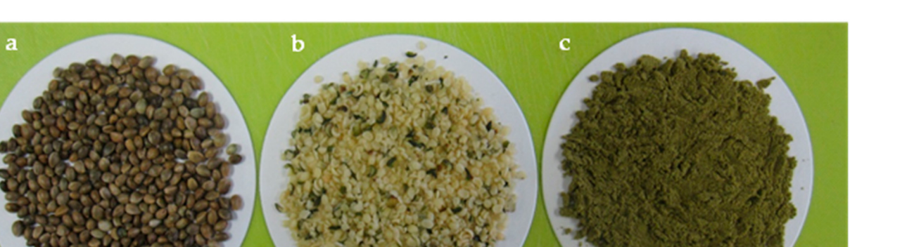
Figure 1. Whole (a) and dehulled hemp seed (b). Hemp flour (c).

Table 1. Comparison of nutritional components between hemp seed and soybean.