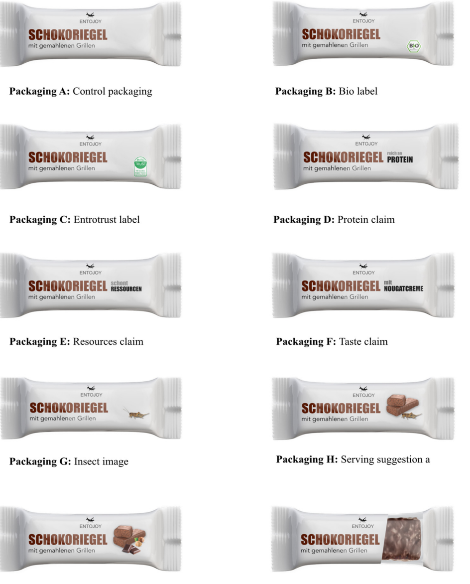
Packaging I: Serving suggestion b

The communication elements tested included labels, claims, images and transparent packaging windows (Figure 2). Each element had its own separate packaging to ensure that any observed effects could be attributed to individual elements, eliminating the possibility that changes were due to a combination of elements. If a significant difference in expressed disgust between the control packaging and the packaging with the communication element was found, it was inferred that the change was induced by the communication element. Care was taken to ensure that respondents did not assume the same product was depicted in every question, as previously seen labels or claims might subconsciously influence perception. Therefore, it was clarified in the questionnaire that each displayed packaging contained a different product.