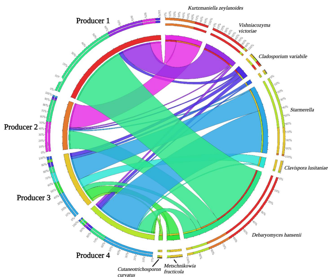
Figure 2. Circular ideogram showing the fungal distribution (>1% of the relative frequency in at least 2 samples) among the Queijo Serra da Estrela PDO cheese samples herein analyzed. Amplicon Sequence Variants (ASVs) and samples are connected with ribbons, whose thickness is proportional to the abundance of ASVs in the connected samples. The outer circle displays the proportion of each ASV in each producer and vice versa.

In more detail, samples from producer 1 were characterized by the presence of Debaryomyces hansenii , Kurtzmaniella zeylanoides , and Vishniacozyma victorae (attesting at 52, 9, and 24% of the relative frequency, respectively). Samples from producer 2 were characterized by the presence of Galactomyces geotrichum , K. zeylanoides , Candida boidinii , D. hansenii , and Naganishia albidosimilis (attesting at 30, 20, 15, 15, and 10% of the relative frequency, respectively). Samples from producer 3 were characterized by the presence of Starmerella , Metschnikowia fructicola , Clavispora lusitaniae , Protomyces inouyei , and D. hansenii (attesting at 18, 8, 7, 5, and 4% of the relative frequency, respectively). Finally, cheeses sampled from producer 4 were characterized by the presence of Starmerella , D. hansenii , Pichia fermentans , Cladosporium variabile , and M. fructicola (34, 11, 4, 3, and 2% of the relative frequency, respectively).