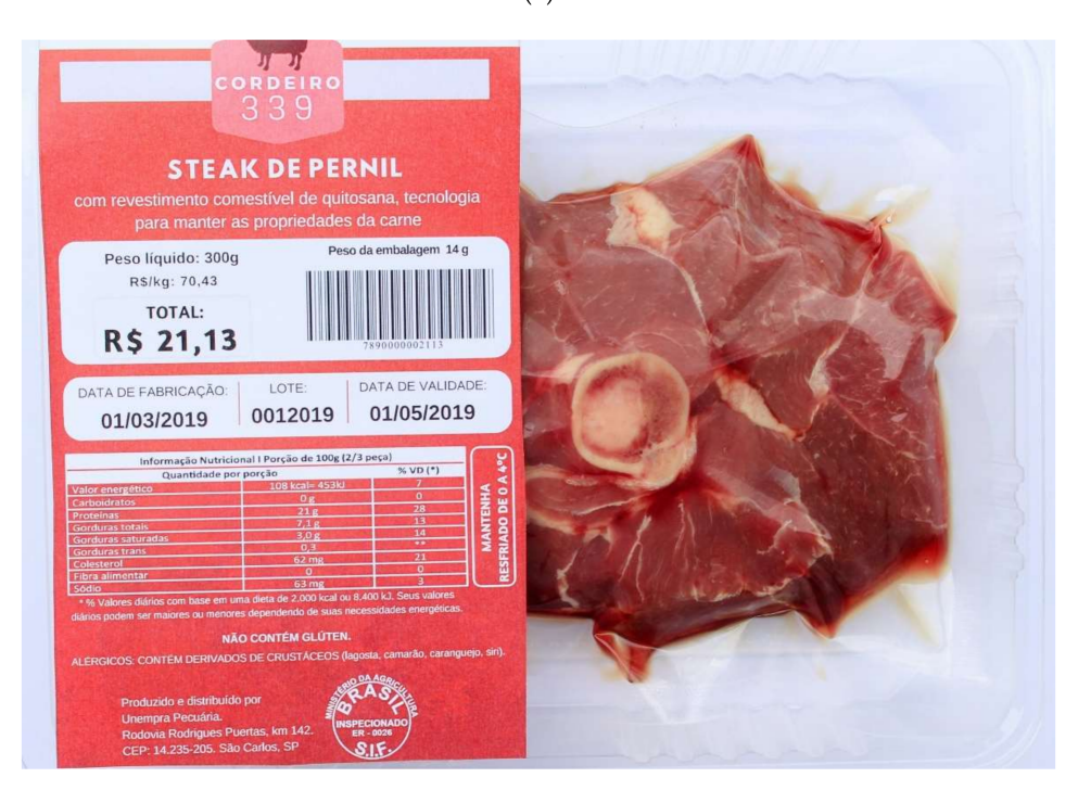
Figure 1. Examples of labels and packagings used in the study (a) treatment 8: chitosan/information, French rack cut ("carré"), low price and (b) treatment 9: chitosan/explained information, leg steak cut, high price.