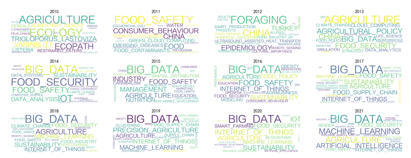
Figure 2. Analysis of the research direction of the data from 2010 to 2021 in the food field. Since 2013, food security and big data have become a focus of researchers interested in the potential value of big data on food. The research focuses on IoT-based data collection and its application to smart farming, supply chain management, food nutrition, and sustainable development.

The authors of this paper hope to help researchers develop a deeper understanding of the research progress of big data in the food field and to provide guidance for further research.