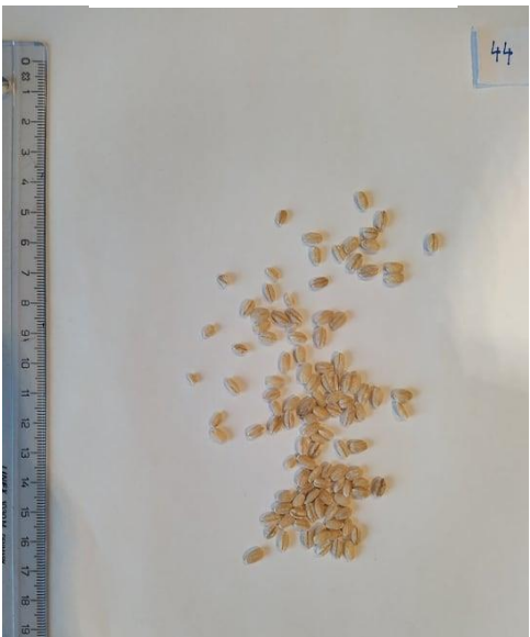
Barley Hordeum vulgare L.