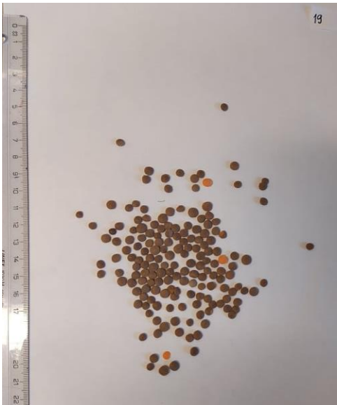
Brown lentil Lens culinaris L.