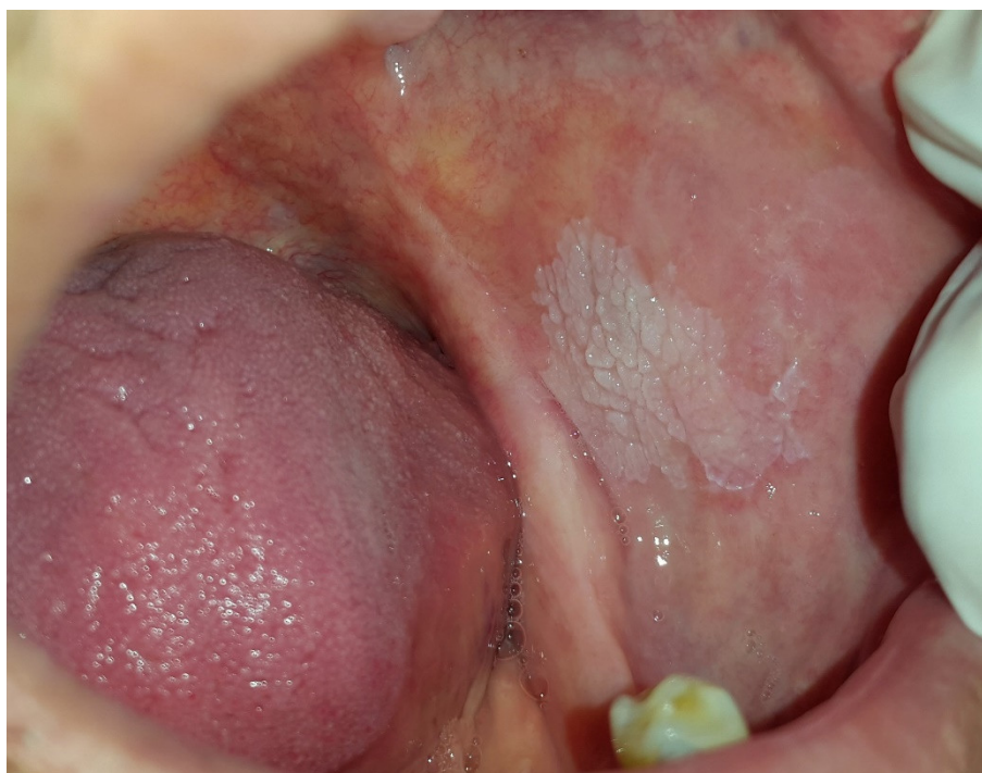
Figure 8. Leukoplakia on the buccal mucosa.