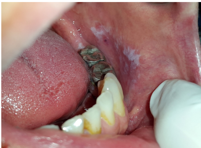
Figure 7. Lichenoid contact reaction in buccal mucosa and alveolar ridge due to amalgam build-up of 1st and 2nd mandibular molar.

No prevalence rate has been reported for LCR yet. Women are affected more frequently than men. Clinically, LCRs show the same features as seen in OLP, that is, reticulum, papules, plaques, erythema, and ulcers [4,5]. The most apparent clinical difference between OLP and LCR is the extension of the lesions. The majority of LCRs are confined to sites just in contact with dental materials, such as the buccal mucosa and the lateral borders of the tongue. Lesions are hardly ever observed in sites such as the gingivae, palatal mucosa, floor of the mouth, or dorsum of the tongue. Most LCRs are non-symptomatic, but the patient might experience discomfort from spicy and hot food when the lesion converts to erythematous or ulcerative forms. The duration of contact with dental material has the key role to develop LCRs on the oral mucosa. Lichenoid reactions caused by dental composites have been observed on the mucosal side of both upper and lower lips. Replacement of dental materials in direct contact with LCR will result in cure or considerable improvement in at least 90% of the cases within one to two months [4,5,30]. However, it is not necessary to replace restorative materials that are not in direct contact with LCRs. While a malignant potential for LCRs has been suggested, no prospective studies have been conducted to support this hypothesis [4].