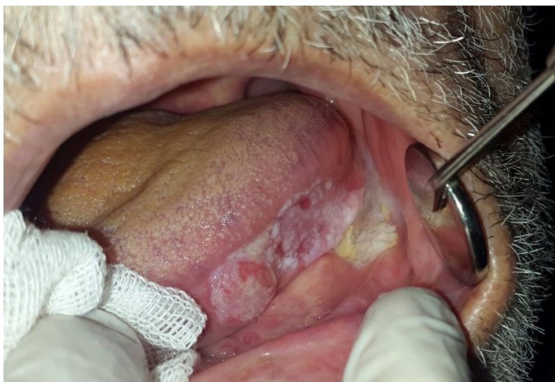
Figure 11. Squamous Cell Carcinoma with verrucous, plaque like and exophytic clinical manifestations at the lateral border of the tongue, extending to the floor of the mouth.

The lesion can be flat or elevated with some palpability or induration. The Floor of the mouth, posterior lateral borders and ventral surface of the tongue are considered high-risk areas for OSCC. Involvement of submandibular and digastric lymph nodes due to cancer causes lymphadenopathy with firm to hard consistency, which converts to fixed nodes in later stages [4,5]. Patients are most often diagnosed in advanced phases after progression of symptoms related to disease. Five-year survival rate of OSCC is about 53–56% [22]. Treatment planning depends on clinical staging; therefore, primary stages are treated by surgical process and advanced cases may be managed by radiation therapy or combined chemoradiation therapy with or without surgery [5] (Table 4).