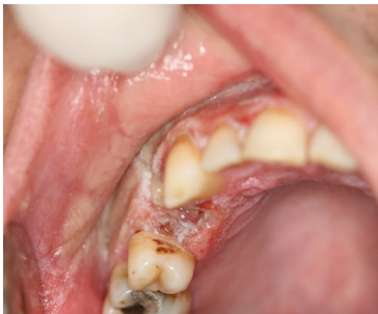
Figure 3. Superficial oral burn due to placement of an over-the-counter anaesthetic gel.

Some of well-documented caustic materials are aspirin, sodium perborate, hydrogen peroxide, gasoline, turpentine, rubbing alcohol, battery acid, isopropyl alcohol, phenol, eugenol, carbamide peroxidase, bisphosphonates, chlorpromazine, and promazine [5,13]. Thermal burn usually is mild and affects just a small area as a sloughy yellow-white necrotic epithelium with areas of erythema and ulceration [5,13,14]. However, chemical burns result in mucosal necrosis with more severe clinical features [13]. In case of short-time exposure to chemicals, the superficial mucosa becomes white and wrinkled, but longer exposures lead to denudation of the epithelial layer and development of a yellowish, fibrinopurulent membrane over the area [5]. Most cases of mucosal burns have little clinical effects and improve without treatment [5,13]. Use of rubber dam is a preventive technique in order to decrease iatrogenic mucosal burns [5]. According to the size and symptoms of the lesions, some recommendations are proposed to manage these conditions such as use of non-steroidal anti-inflammatory drugs (NSAID's), antibiotics, antiseptic mouthwashes, coverage with a protective emollient paste or a hydroxypropyl cellulose film, topical anesthetics, and surgical debridement [5,15] (Table 2).