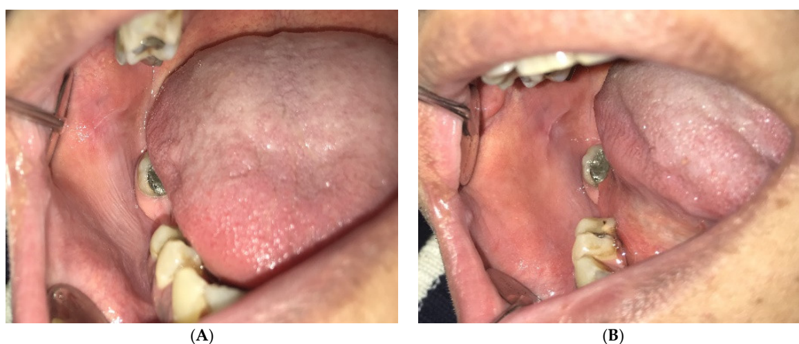
Figure 2. Leukoedema: (A) White appearance of buccal mucosa due to Leukoedema. (B) By stretching the mucosa, the white wrinkled area disappeared.

Leukoedema is a common normal variation of the oral mucosa. The prevalence has been reported up to 90% among blacks and between 10–50% in whites, with no sex predilection [4–6]. Higher prevalence among blacks is possibly due to more mucosal pigmentation making this condition more apparent [5]. It is more distinct in smokers; however, after smoking cessation, it becomes less obvious. It seems to be a developmental variation with an unknown etiology [4,5]. Clinically it presents as a diffuse, gray to white, non-scrapable and veil-like condition, which can be described as a milky and opalescent transformation of the oral mucosa. In more prominent cases, leukoedema is characterized by mucosal folds along with wrinkles or whitish streaks. This condition usually disappears temporarily after gentle stretching of the mucosa, which reappears after quitting the manipulation (Figure 2).