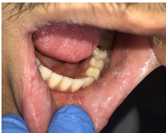
Figure 5. Habitual biting of cheeks and the lower lip.

Morsicatio originates from the Latin word morsus , meaning “bite”, which also called morsicatio mucosa oris or chronic mucosal chewing [5]. This lesion is caused by self-induced injury and chronic tissue irritation like habitual chewing of buccal mucosa, chronic nibbling, biting, or sucking (Figure 5).