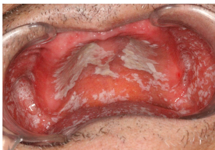
Figure 4. Pseudomembranous candidiasis due to using broad spectrum antibiotic; pseudo membranes can be scraped off by a piece of gauze.

Oral candidiasis is the most common fungal infection of the oral cavity mostly caused by Candida Albicans as one of the normal microflora organisms [4,16]. It can be isolated from almost 50% of dentate patients and more than 60% of edentulous individuals with a female predilection [4]. The acute pseudomembranous form of oral candidiasis is usually seen in infants due to their underdeveloped immune system, the elderly because of their compromised immunity and patients on broad-spectrum antibiotics [4,17] (Figure 4).