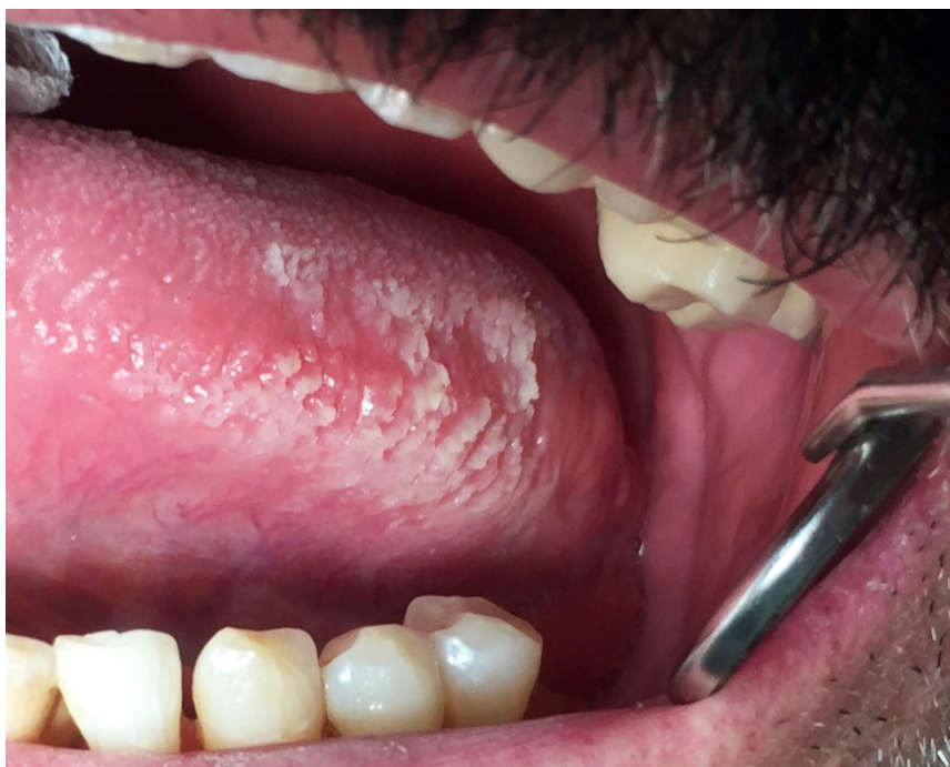
Figure 9. Oral hairy leukoplakia on the lateral border of the tongue with vertical white folds.

of progress towards AIDS stage in HIV infection, but it might occur in other states of immune deficiencies and very rarely in immune competent individuals [4,5,17,34]. Highly active antiretroviral therapy has reduced the prevalence of OHL significantly, however, in patients with AIDS the prevalence rises to 80%. OHL is more commonly observed among men with no potential for malignant transformation [4,17]. It is clinically described as whitish nonscrapable velvety plaques that symmetrically involve the borders of the tongue unilaterally or bilaterally. The shape of plaques varies from slight, white vertical bands to thickened, furrowed areas with a shaggy surface [5,34,35] (Figure 9).