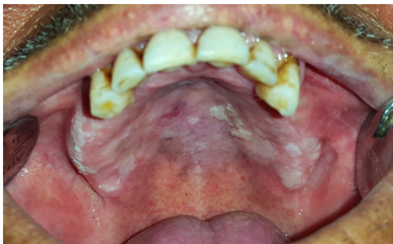
Figure 10. Proliferative verrucous leukoplakia spreading over hard palate and alveolar ridges.

The lesions enlarge slowly and constantly over time involving diffuse surfaces of the mucosa. Meanwhile, non-homogeneous multifocal areas with speckled and rough surface might appear in the form of exophytic, wart-like, verrucous, polypoid projections or erythematous features [5,34,36,37]. PVL usually develops bilaterally, which affects the buccal mucosa, gingivae, and alveolar ridges. The gingivae have been reported as the most affected area; hence a PVL subtype named proliferative verrucous leukoplakia of the gingivae has been proposed [22,36,37]. The rate of malignant transformation for PVL is reported between 63.3% to 100%. It might eventually progress to develop OSCC or verrucous carcinoma [22,36]. Various treatments modalities such as surgery, carbon dioxide laser ablation, topical photodynamic therapy, oral retinoids, topical bleomycin solution, beta-carotene, methisoprinol (a synthetic antiviral agent), radiation, and chemotherapy are suggested. PVL is a refractory condition with a recurrence rate of 85%. None of the treatment methods is effective in quitting relapses and malignant transformation, and therefore a lifelong follow-up is mandatory [36,37].