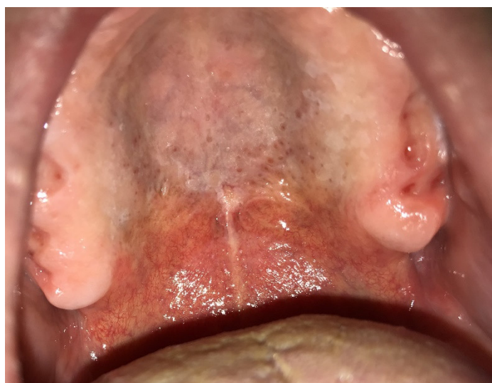
Figure 12. Nicotinic stomatitis on the hard palate.

Nicotine stomatitis is a usual white lesion due to smoking, which is also called Nicotine Palatines or smoker's palate [4,5]. This condition is commonly seen among heavy smokers of pipe, tobacco, cigarettes, and reverse smokers as well as patients who drink extremely hot beverages habitually. A frequency of 0.1% to 2.5% has been reported with a predilection for men older than 45 years [4,5,7]. Albeit both high temperature and chemical ingredients of smoke have synergistic effects on developing nicotine stomatitis, the impact of high temperature is much higher than that of chemicals. Nicotine stomatitis primarily presents as an erythematous area on the posterior rugae; then the lesion converts to diffuse leathery grayish-white palatal plaque. Red points can also be seen on the white mucosa that are actually widened and swollen orifices of accessory salivary glands with periductal nodular keratinization (Figure 12).