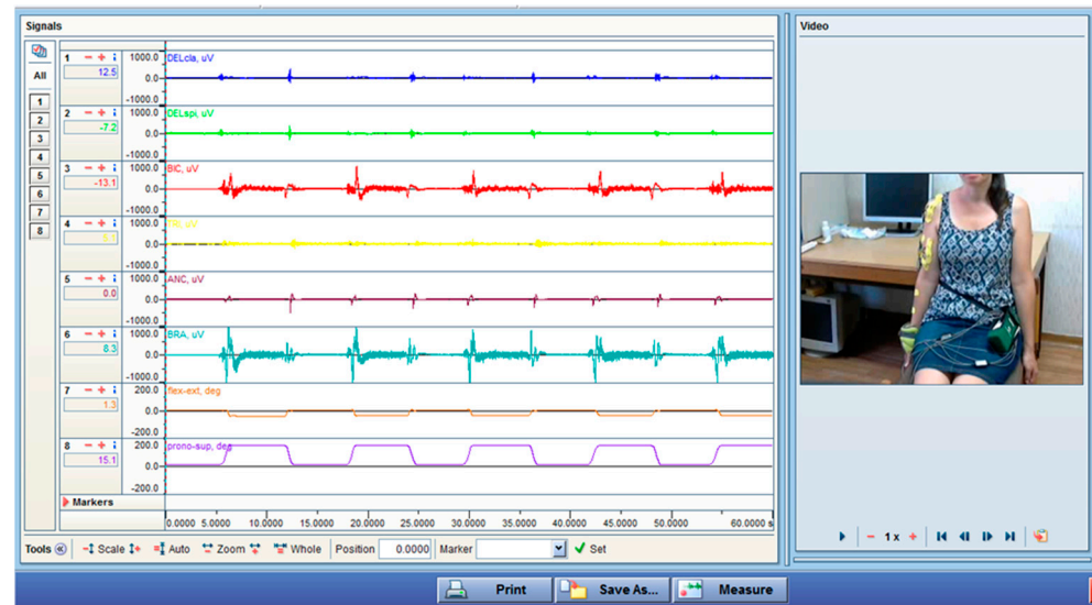
Figure 1. A picture of the experimental setup with raw EMG signals.

chosen after careful visual inspection. The start and end of flexion and extension motions were determined, and one time period was chosen. In these intervals, the EMG data were rectified and smoothed (20 samples). The area under the obtained curves was calculated and divided into the respective time intervals. ICrA, briefly presented in the next subsection, is applied to the obtained values.