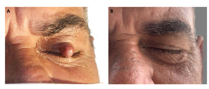
Figure 1. Clinical aspects of the intratarsal keratinous cyst. (A) Observe a well-delimited small nodular sessile lesion with a reddish color on the left upper eyelid. (B) Clinical appearance one year after lesion removal.

A 61-year-old non-white patient presented at an oral and maxillofacial medicine service with a six-month history of a lesion on the eyelid. Physical examination revealed a painless firm nodule on the left upper eyelid, measuring approximately 1.0 cm in diameter. No history of local trauma was reported (Figure 1A). The overlying skin was normal, with no inflammatory signs, and freely movable. Eversion of the eyelid revealed a subsurface intratarsal lesion with a slightly pale yellow bulging. The patient also complained of blurred vision in the left eye. A provisional diagnosis of chalazion was given, and total excision of the lesion through a lid crease incision was carried out.