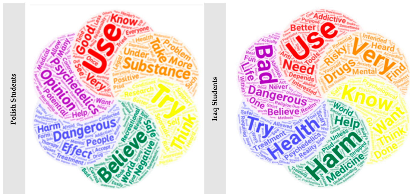
Figure 2. Word cloud showing medical students' opinions on psychedelics.

psychedelics accurately ( OR = 42.37, [19.56, 91.78], p < 0.001 ), whereas a significantly smaller number of their Iraqi counterparts reported using these substances ( 23.07, [9.18, 57.99], p < 0.001 ). Furthermore, a higher percentage of Polish students utilized psychedelics as cognitive enhancers for better academic performance ( OR = 12.44, [1.57, 98.71], p < 0.003 ). Additionally, many Polish students perceived the ease of accessing or purchasing psychedelic substances ( OR = 2.16, [1.59, 2.94], p < 0.001 ). In contrast, more Iraqi students held pessimistic (opposing) views regarding psychedelics ( OR = 1.51, [1.13, 2.02], p = 0.006 ), deeming even their sporadic use as risky ( OR = 1.33, [0.99, 1.79], p = 0.054 ) (Figure 2).