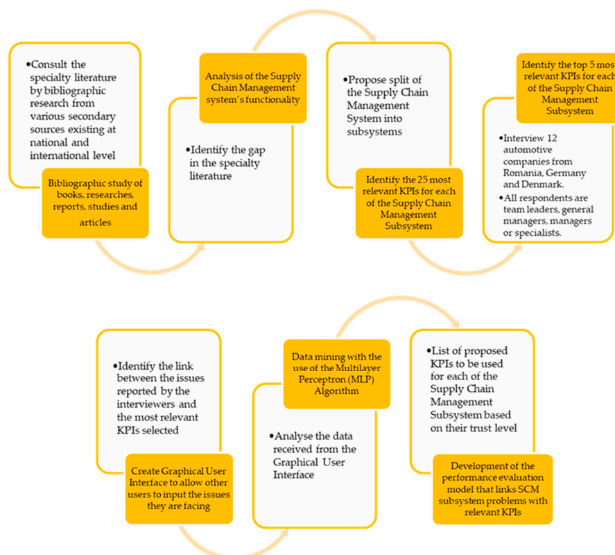
Figure 1. Logical scheme of the research methodology.

To support and validate the proposed model, an initial top-25 most relevant KPIs have been selected based on literature review. The method of the interview guide has been used, through which 12 international automotive companies have been analyzed, with the purpose of identifying the most-reported issues the organizations face and to determine the 5 most relevant KPIs for each SCM subsystem. Based on the gathered data, the link between the reported issues and the relevant KPIs to monitor these issue were identified. A graphical user interface (GUI) was created, which converts the input data into digestible 1 s and 0 s required by the multilayer perceptron (MLP) algorithm. With the use of data mining and the MLP algorithm, a list with the most suitable KPIs to be used by an organization is generated, with a trust level learned by the MLP algorithm from the provided data. Considering all these steps, it was made possible to develop a performance evaluation model for the holistic supply chain management system encompassing the nine subsystems, which provides a clear link between the input issues provided by the user via the GUI and the output KPIs provided by the MLP algorithm via data mining and artificial learning. The materials and methods used to analyze and interpret the gathered data are data mining and the multilayer perceptron algorithm. The input values have been written using Python. The logical scheme of the research methodology has been represented in Figure 1.