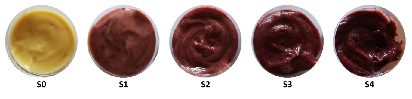
Figure 1. Images of the mayonnaise without BPP, control (S0); mayonnaise with 1.5% BPP (S1); mayonnaise with 3% BPP (S2); mayonnaise with 5% BPP (S3); mayonnaise with 7% BPP (S4).

The value-added mayonnaise samples were obtained by enrichment with different amounts of BPP (1.5, 3, 5, and 7%), and their physical-chemical composition was evaluated (Figure 1, Table 1).