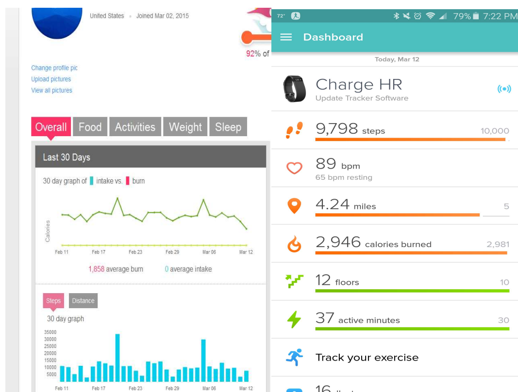
Figure 1. Fitbit screenshot of participant focusing on motivation metrics.

The apps provide users with an overview of their specific performance details and an overview of their general wellness; offering continuous positive reinforcement. The Dashboard enables users to both assess their level of competency (or self-efficacy) as well as their autonomy to better perform specific fitness activities. This is further supported by the overviews of motivating data (sleep, healthy eating, and exercise), that provide an instant “progress toward my goal” feature (see Figure 1). While the FitBit allows users to self-interpret, the Jawbone provides a rolling interpreted summary and action recommendations as well as challenges aka SmartCoach with trends and patterns of Steps and Sleep (toward a goal and average for that user’s gender and age based on others data).