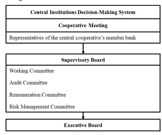
Figure 2. The ownership and governance structure of Magnus Localis Bank.